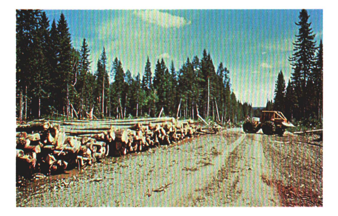
During a spruce budworm outbreak salvage logging is an excellent means of protecting investment dollars and reducing spruce budworm outbreak potential.