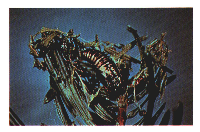
Spruce budworm pupa. Pupation takes place in the feeding shelter in late June and early July.

Mature spruce budworm larva. Full-grown caterpillars reach about 1¼ inches in length.