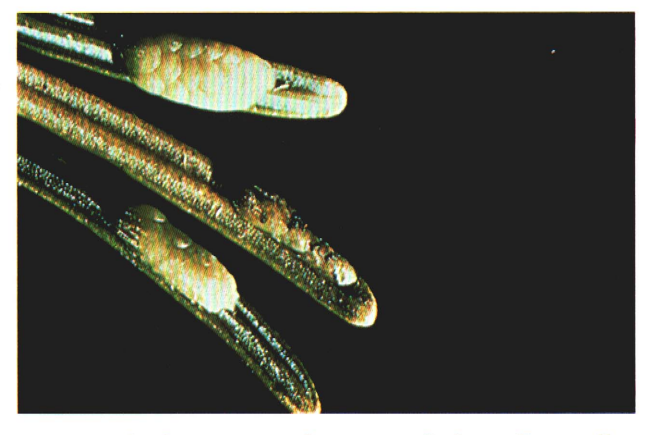
Spruce budworm egg clusters on balsam fir needles. Each cluster numbers from 5 to 50 eggs. Black dots are eggs that have been killed by a parasitic wasp.

Extension Bulletin E-1245, June 1978 COOPERATIVE EXTENSION SERVICE, MICHIGAN STATE UNIVERSITY