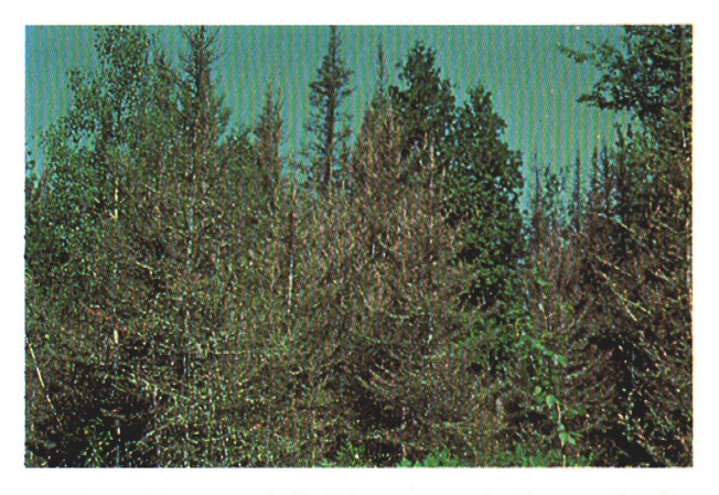
Balsam fir trees killed by spruce budworm feeding. Top-killing usually occurs after about 3 years of severe infestation and tree mortality begins after 5 years.