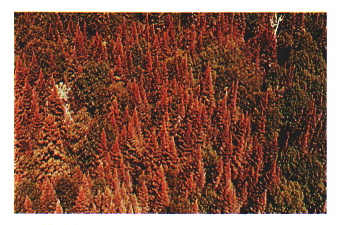
Reddish-brown hue seen in mid-July during a spruce budworm infestation. Needles clipped and webbed into feeding sites turn color creating an alarming appearance of damage.

Spruce budworm feeding damage on balsam fir foliage. Caterpillars begin feeding on new shoots but will also move to old needles if new shoots have been exhausted.