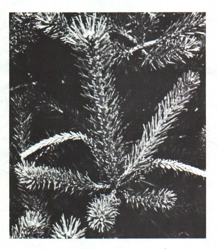
Figure 1. Eastern pineshoot borer injury on Scotch pine.

Preventing Damage: Although the injury caused by the eastern pineshoot borer is quite visible, the damage does not pose any problems to the vigor of the tree. Many attacks may damage the form of the tree, but the damage is minimal since the insect seldom attacks the terminal leader. The injured shoots will set buds and grow again the next growing season just as if the branch had been sheared. Bushiness will result, but this is desirable for Christmas trees. However, the injury is detrimental to the aesthetic value of the tree because the dead, brown branch tips are unattractive to Christmas tree buyers. The number of pineshoot borers can be reduced by normal shearing in June and early July