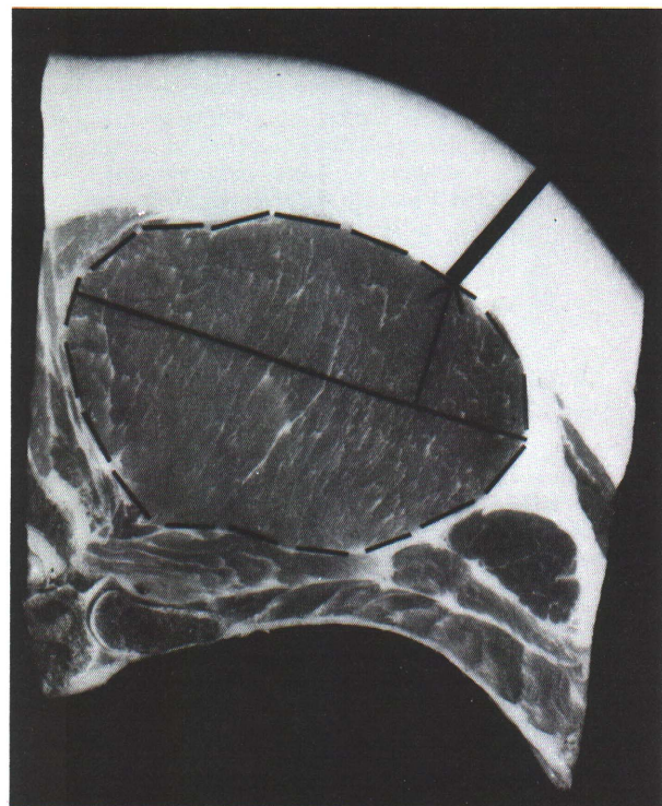
Figure 1. Loin muscle area and fat depth at 10th rib location.

recorded, convert to a hot weight basis by dividing by .985 because most carcasses shrink about 1.5% during drying and chilling. For skinned carcasses, adjust to a skin-on basis by dividing the hot weight by 0.94 (the skin accounts for about 6% of the hot carcass weight), or by another more appropriate value that might be provided by the plant management.