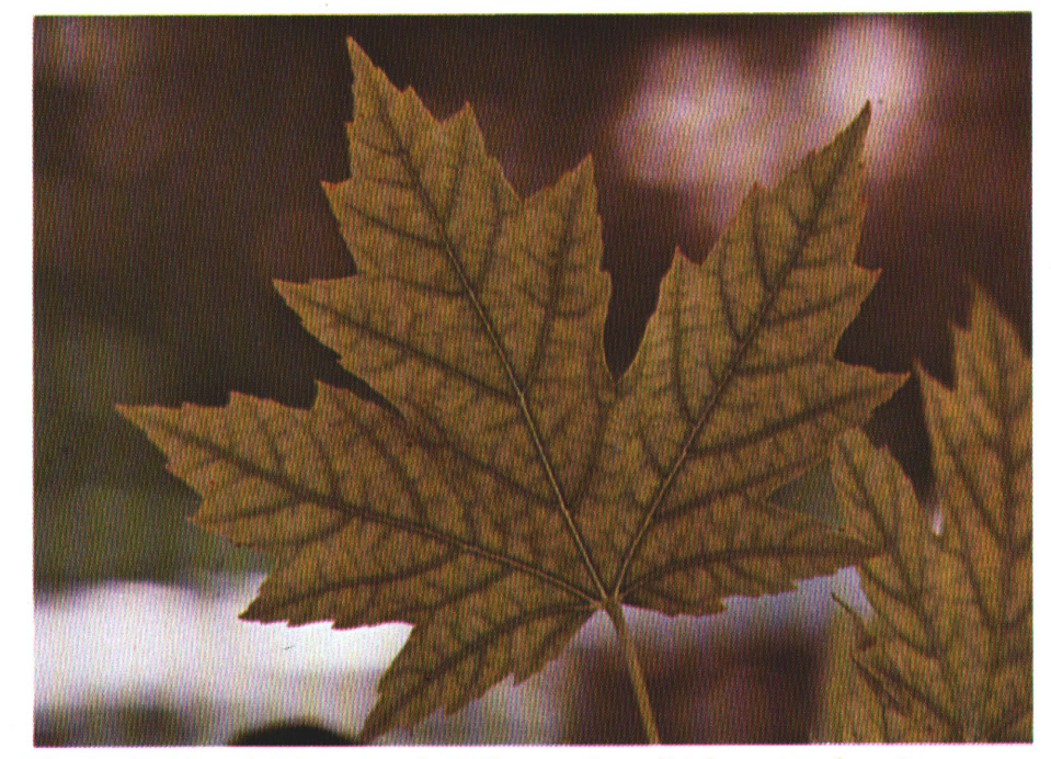
Fig. 4. Nutrient deficiency in a leaf. The area immediately next to the veins are green, while the other tissues are yellow.

serious damage or defoliation of trees. In some circumstances, misuse of herbicides can kill trees. If damage is already evident, a thorough watering and fertilization is the best action to promote recovery.