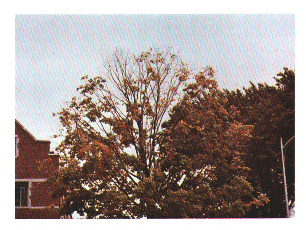
Fig. 3. Top dieback often exhibited by trees under stress. This symptom can result from salt damage or any other type of root injury such as girdling roots, compaction and soilfill damage.

Leaves can be damaged in late spring by frosts. Young leaves may suddenly turn brown or black several days after a frost; also, curled leaf edges may be present. If the leaves are not killed, they often have jagged open spaces which are similar to feeding holes made by certain insects. Wind damage may also appear on young leaves, especially on newly transplanted trees. Symptoms of wind damage are also jagged, torn leaves not unlike some insect damage to leaves. Little, however, can be done to control wind and frost injury. Most trees will recover and put on new healthy leaves, if they have been maintained and are in good health.