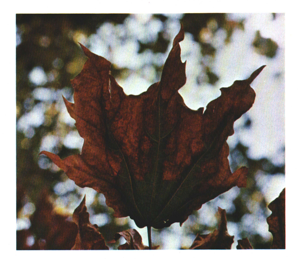
Fig. 1. Maple leaf showing symptoms of leaf scorch. The area closest to the veins remains green, while the leaf margin and the area between the veins is brown.

Often in mid to late summer maple leaves show a browning or drying at the outer margin of the leaf or in the areas between the veins (Fig. 1). The areas near the veins generally remain green; however in extreme cases the entire leaf may dry and fall prematurely. This may lead to scorch caused when leaves lose water more rapidly than moisture can be replaced from the soil. This can be caused by too little water in the soil or a physical restriction of the root.