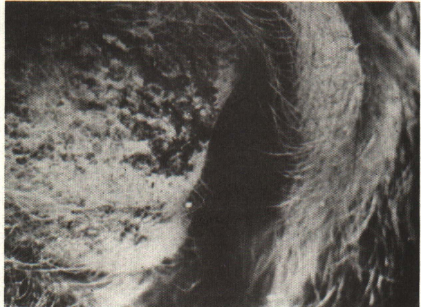
Figure 4. Close-up view of Sarcoptes -infested outer ear, showing thickened skin with scab formation.

parasite's life cycle. Because of the increased susceptibility of baby pigs to lice and mange and the increased toxicity of many chemicals to pigs under weaning age, the sow becomes a focal point for pest control measures.