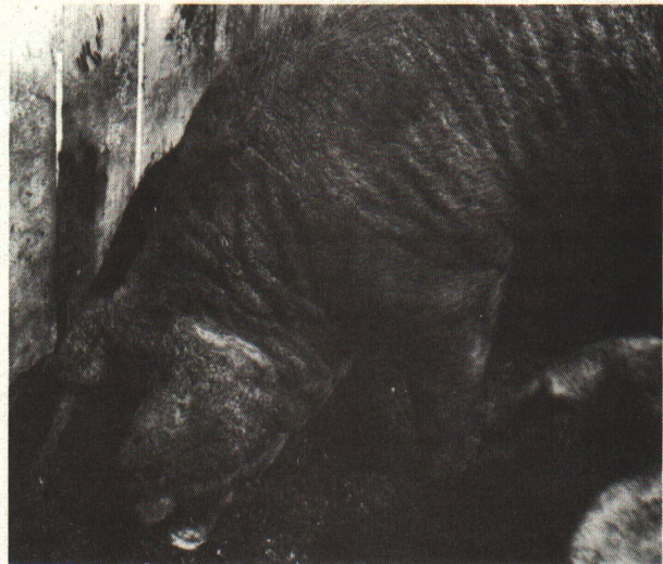
Figure 3. Shown is a severe sarcoptic mange infestation in a mature pig. It is characterized by rough, thickened folds denuded of hair on the ear and neck regions.

Successful treatment of lice and mange is a difficult assignment because it requires a complete break in the