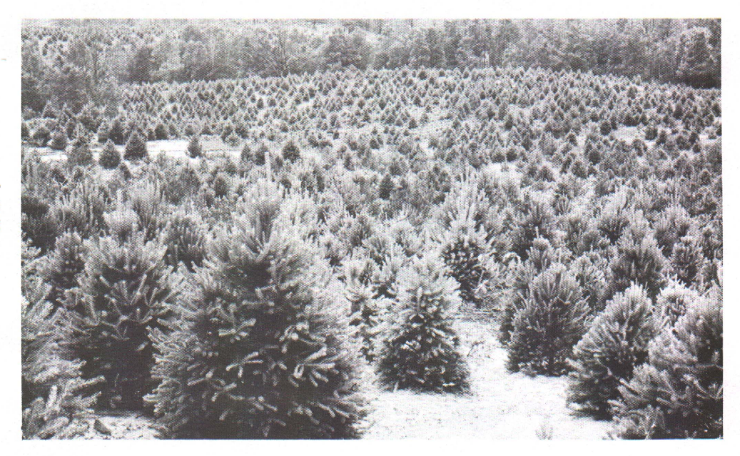
Small tracts of rough or irregularly shaped land are well suited for growing Christmas trees.

Generally speaking, yes, although some areas are better suited than others. A combination of adverse climate and unfavorable sites prevents some species such as Fraser fir, Douglas fir, and certain varieties of Scotch pine from growing well in northern areas; however, other species such as white spruce and balsam fir can grow very well. These latter two species are commonly planted in the southern portion of the state as well. Harvesting may be more difficult in northern counties, owing to heavier snow conditions in the late fall. Furthermore, the distance to large metropolitan marketing areas is greater for trees produced in northern Michigan plantations.