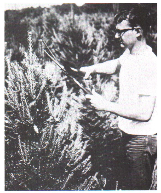
Annual shearing of individual trees beginning the third or fourth year following planting is required to produce quality trees.

knife, or hand or hedge clippers. The pruning knife does the best job, but it is not for amateurs or children. Adequate safety precautions should be taken including training and protective guards for hands and legs.