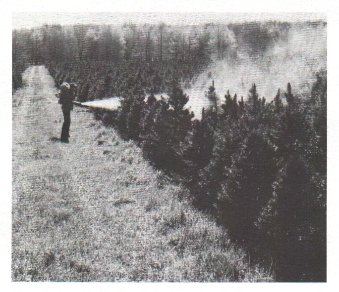
Chemical control of certain insects may be necessary to maintain quality foliage on Christmas trees.

Choose-and-cut operations are well suited for plantation locations near metropolitan areas. Success depends on a good selection of trees, advertising, adequate parking, ability to handle crowds and deal directly with people. Of all marketing methods, this can be most profitable and the only approach