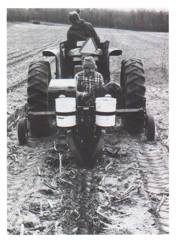
Machine planting is well suited for planting trees in larger open areas.

Nearly all plantings of Christmas trees are made in the spring. In the lower peninsula, planting may begin in late March, particularly on light, sandy soils. In the northern part of the state, planting often extends into May. If container-grown stock is to be used, planting may be completed later in the growing season.