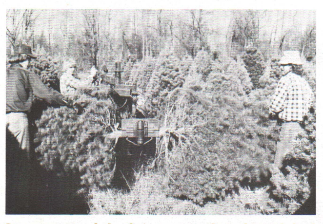
Some growers shake their trees to clean them of dead needles and other debris before baling for shipment and sale.

suitable for the part-time operator with a few acres of land. The land must be adjacent to the residence or full-time occupancy at the plantation site during the harvest period is essential.