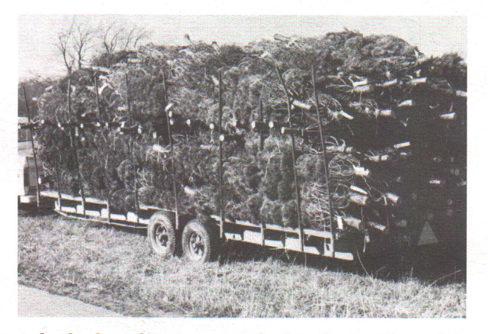
A load of quality trees ready for the retail market. Premium trees may be produced within 8 years from well managed plantations.

Using Scotch pine as an example and assuming an eight-year growth period to produce a 7 foot tree, the following costs are somewhat typical of what might be expected on a per-acre basis (1,000 trees actually planted). Because land ownership costs are highly variable and are incurred on owned land whether or not trees are planted, they are not included here.