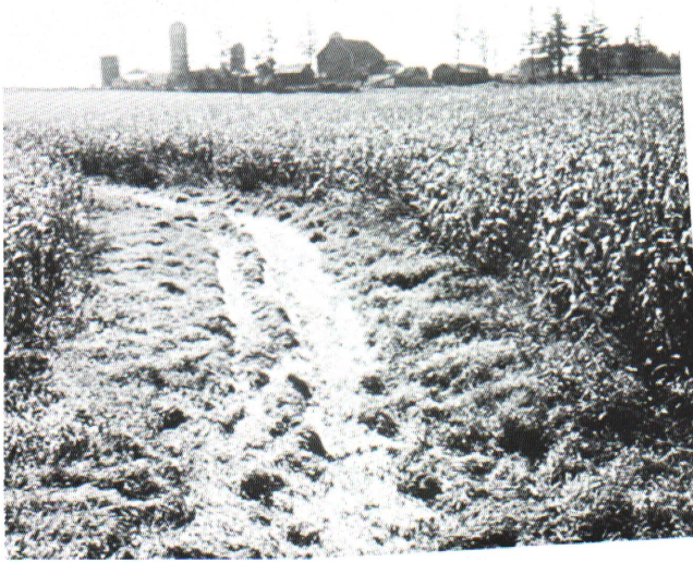
Figure 8. Sod waterway in corn field prevents erosion. The best waterways are designed by engineers who can interpret crop requirements, soil variability and surveying and hydraulic principles.

contour tillage is not possible in many parts of Michigan because of short, irregular slopes. However, tilling across the slope as much as possible reduces erosion in the parts of the field where the tillage operations are on the contour.