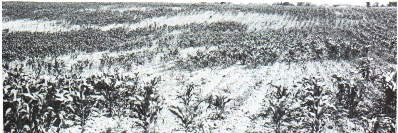
Figure 1. Variable stands of corn reflect severely eroded areas, which results in wasted seed and fertilizer and in reduced yields. Furthermore, with such stands, the soil in the eroded area remains unprotected for the entire season.

Michigan's citizens are all affected by soil erosion. Obviously, farmers are hurt when erosion oc-