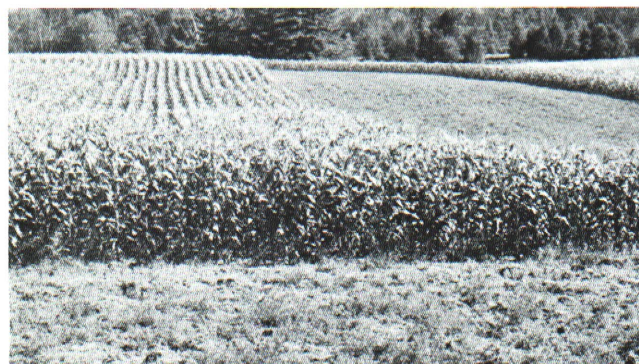
Figure 5. Strip-cropping in Montcalm County. Corn and sod strips provide erosion control on 5 to 10 % slopes.

sod crops in alternate strips across a slope (Figure 5). In rolling topography, especially where slopes are long, this practice has merit because runoff from the cultivated area is retarded by the close-growing crop resulting in greater absorption of runoff and deposition of sediment.