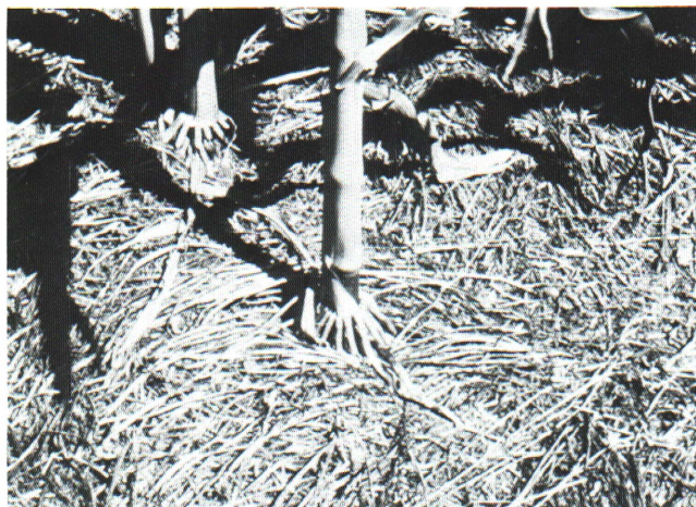
Figure 4. No-till corn planted in sod. No-till methods represent the most recent innovation in erosion control in fieldcrop production.

Very few crop producers in Michigan use the concept of growing cultivated and close-growing or