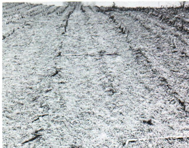
Figure 7. Livestock manure top-dressed to eroded soil in field used for silage corn is an effective method for preventing soil erosion.

Tilling across rather than up and down the slope produces small dams to slow the water flow. Strict