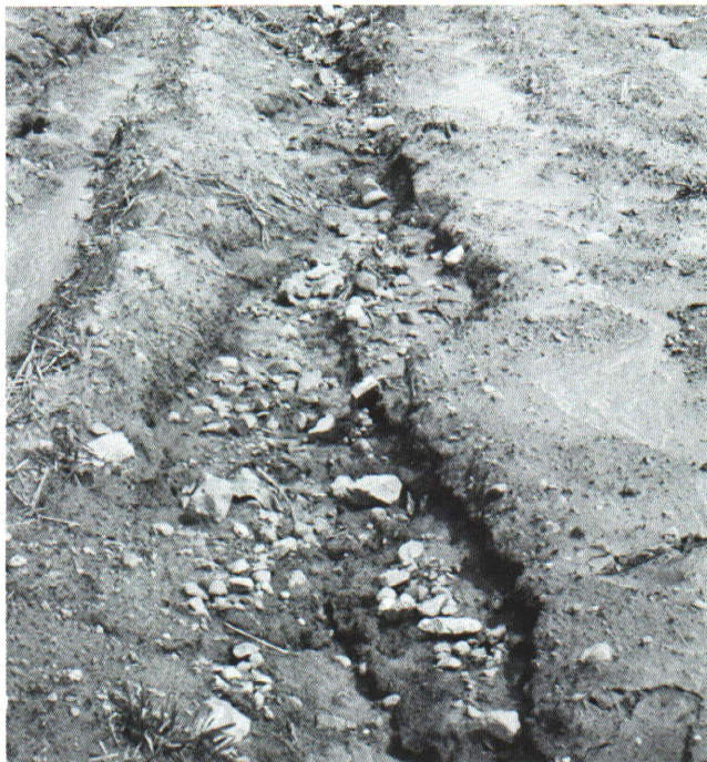
Figure 2. Rill erosion on fall-plowed hilly crop land in Ingham County.

A raindrop hitting a wet soil causes a slight depression with compacted soil material below the center. The force of the drop detaches minute particles from the soil mass and moves them away from the drop area. In a heavy rain on summer-fallowed