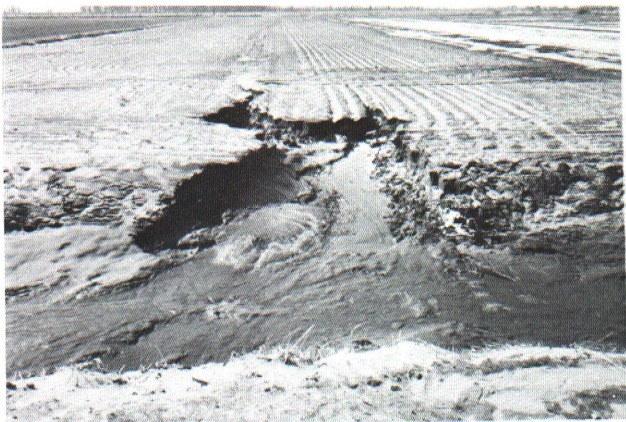
Figure 3. Shallow gully erosion on flat land in Saginaw County. Erosion is occurring where water enters road ditch. This resulted after road was improved. No vegetation was ever established on the ditch banks.