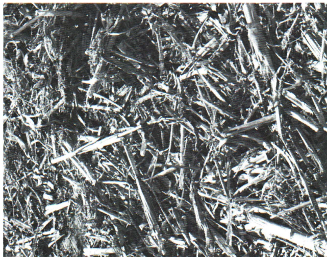
Figure 6. Corn residues after the harvest of a high yielding crop. This picture shows 5,790 pounds per acre of residue. Little erosion is likely under these conditions.

Cover crops can be used to reduce erosion where crop residues are removed or sparse. A cover crop is one grown just to protect the soil. Oats planted in late summer-plowed fields provide a blanket to the soil while they are growing as well as after they are frozen. Rye is the old standby for those who do not fall plow. With modern herbicides, such use of rye is now feasible.