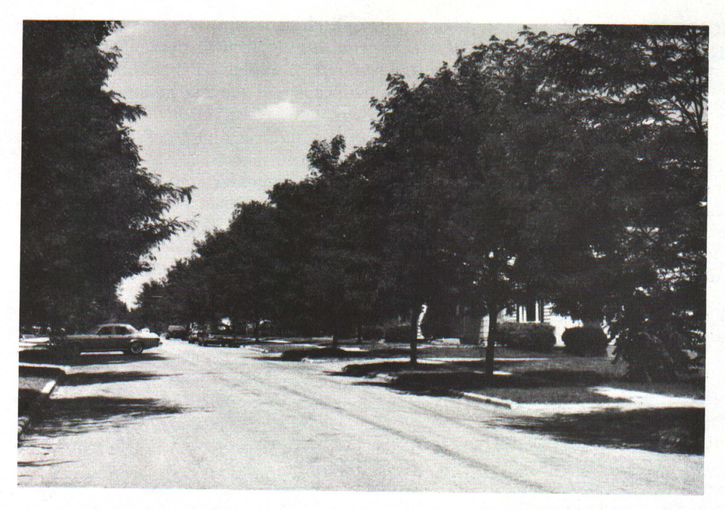
With a good tree-planting and maintenance program and several years growth, streets can be more aesthetic.

ty. Call your County Extension Director for access to urban forestry specialists at Michigan State University.