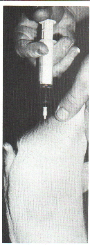
Figure 3. Injecting a baby pig with iron-dextran.