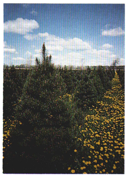
Scotch pine, the most widely planted species for Christmas tree production, is well adapted to a variety of soils and planting sites and responds well to plantation production.

• Southern Lower Michigan—Southern France, Turkey (Armenia), East Anglica. (Spanish seed sources have been widely used in the past, but sustained severe injury during the winter of 1976-77.)