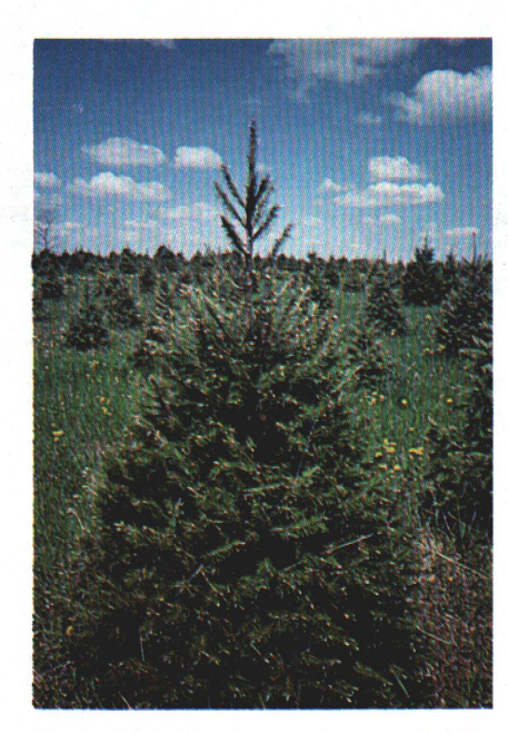
Douglas-fir, considered by many to be the premium Christmas tree species, is characterized by short, flexible needles which remain strongly attached to the twigs following cutting.

These suggestions for species selection do not preclude the use of other species. In fact, with few exceptions, nearly every conifer can be developed into an attractive Christmas tree, although not necessarily on a commercial level. The species recom-