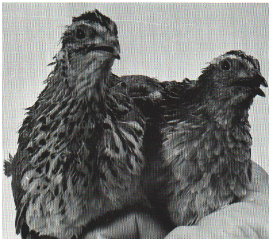
Fig. 1—Left: female adult quail; right: male adult quail.

Adult females are generally larger than the males and weigh in the range of 120-160 grams (4.5-6 oz.). By selection, heavier birds can be produced for meat. The females can be easily identified by their plumage color under the throat and upper breast. The color is slightly whiter than the male and is characteristically black-stippled. In this area the feathers are longer and more pointed than feathers of male birds. Female birds are of short life span compared to the male. They may start laying eggs as early as