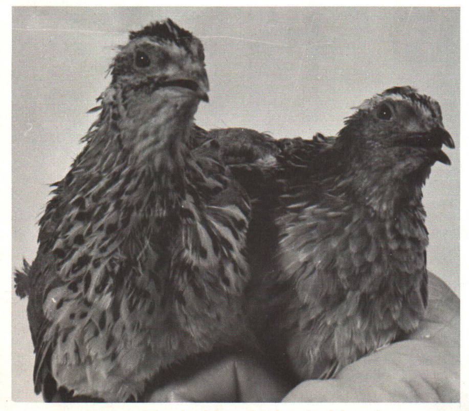
Fig. 1-Left female adult quail, right male adult quail.

Japanese quail have been widely distributed in Europe and Asia. Egyptians used to trap large quantities