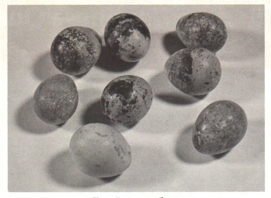
Fig. 2—Japanese quail eggs.

Domesticated quail do not have the tendency of broodiness, and hence, eggs must be incubated under a