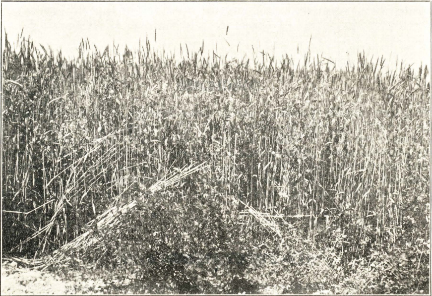
Fig. 6.—Rye and vetch may be used for both hay and pasture on sandy soils.

This mixture is sometimes used as a hay crop on sandy soils, and is one of the best mixtures for late fall and early spring pasture. Though rye may not be quite so palatable as some other crops, it does make a late fall growth, as well as a quick growth in the spring. The mixture is usually sown the latter part of August, using one bushel of rye and 20 pounds of Hairy Vetch seed per acre. In a few sections, especially the northwestern part of the Lower Peninsula, where the snow fall is rather heavy, vetch may be sown during the latter part of September. In the southern part of the Lower Peninsula, winter killing frequently occurs when vetch is seeded later than the first of September.