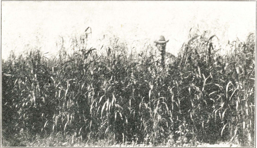
Fig. 5.—Sudan grass on a sandy loam soil. An excellent yield of a carbonaceous roughage.

Usually one hay crop and a second crop for pasture or plowing under is secured; however, in the southern part of the State, two hay crops are sometimes obtained the same season.