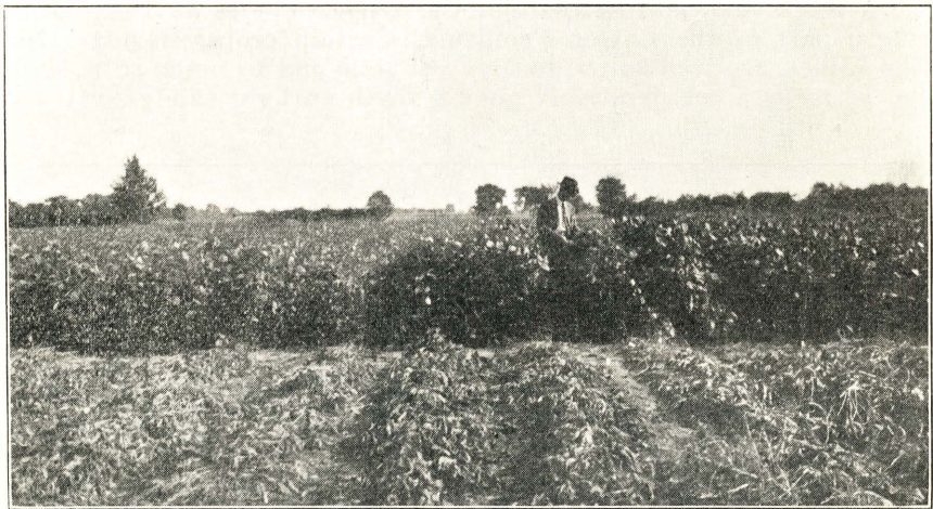
Fig. 2.—Soybeans furnish good yields of high protein hay.

Soybeans are the leading high protein emergency hay crop for the dairymen of the Lower Peninsula. The hay is very palatable for other kinds of livestock, such as horses and sheep. Under average conditions, soybeans should yield from two to three tons of high protein hay per acre, the feeding value of which compares very favorably with alfalfa and clover hay. Soybeans are less sensitive to soil acidity than alfalfa, sweet clover, or June clover; consequently, the farmer who is not in a position to apply lime at once, and is in need of legume hay, will do well to consider this crop.