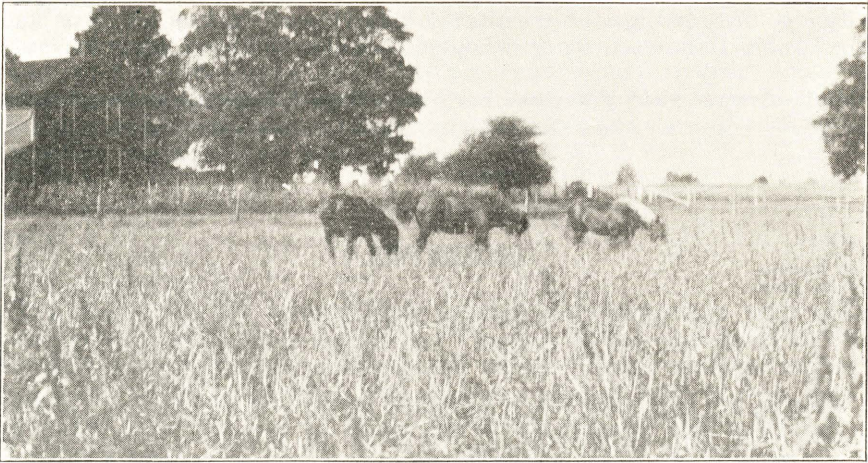
Fig. 3.—Sudan grass is one of the best crops to furnish abundant pasturage for horses and cows during July and August of the same season sown.

Sudan grass sown the latter part of May or the first part of June should be ready to pasture by the first of July. If pastured judiciously, it will make a continuous growth until killed by frost in the fall.