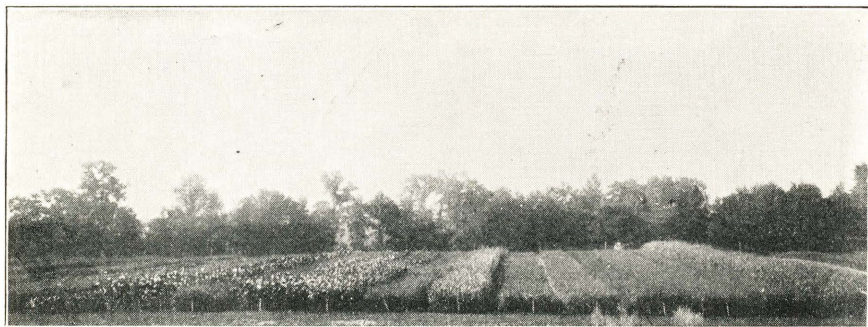
Fig. 1.—Soybeans, millets, Sudan grass, sorghums, corn, and other emergency hay crops in comparative tests at East Lansing, Michigan.

When clover and alfalfa seedings fail, emergency hay crops become a necessity on farms where livestock is kept. Furthermore, lack of rain or other adverse conditions causing pasture shortage may render profitable the use of emergency pasture crops. A number of crops can be used for these purposes, but no single crop can be said to be best suited to all conditions. The protein content of the various crops, as shown on page 12, varies considerably, and dairy farmers usually secure better results with high protein crops. The section of the State also influences the choice of the crop. Soybeans may be grown to advantage in many parts of the Lower Peninsula, but are suited to only a limited portion of the Upper Peninsula. On the other hand, peas make a more luxuriant growth in the Upper Peninsula than in the northern part of the Lower Peninsula. Certain crops, such as Hungarian Millet, are well suited to low wet soils and to muck soils, while soybeans make a comparatively good growth on light sandy soils.