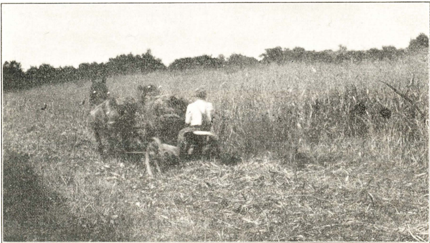
Fig. 4.—Harvesting a field of Sudan grass in South Central Michigan.

Being related to the Sorghums, Sudan grass is just sweet enough to be palatable. Caution should be exercised in pasturing Sudan grass that has been severely injured by drouth or frost, since the injured plants may contain sufficient prussic acid to cause poisoning. The United States Department of Agriculture reports that cases of such poisoning are very rare.