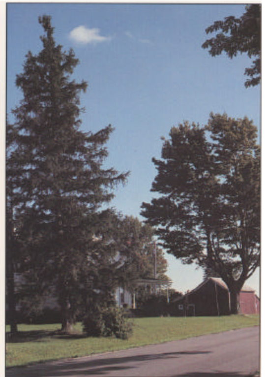
Figure 6. Norway spruce has been widely planted for ornamental purposes. Its popularity as a Christmas tree has declined due to poor needle retention.