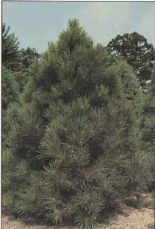
Figure 4. Austrian pine can be managed to produce an attractive Christmas tree. Its stiff foliage and strong branches make it particularly desirable for flocking.