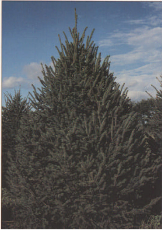
Figure 7. White spruce has attractive foliage and a pleasing natural shape. While popular in some choose-and-cut operations, it is less commonly planted for the wholesale market.