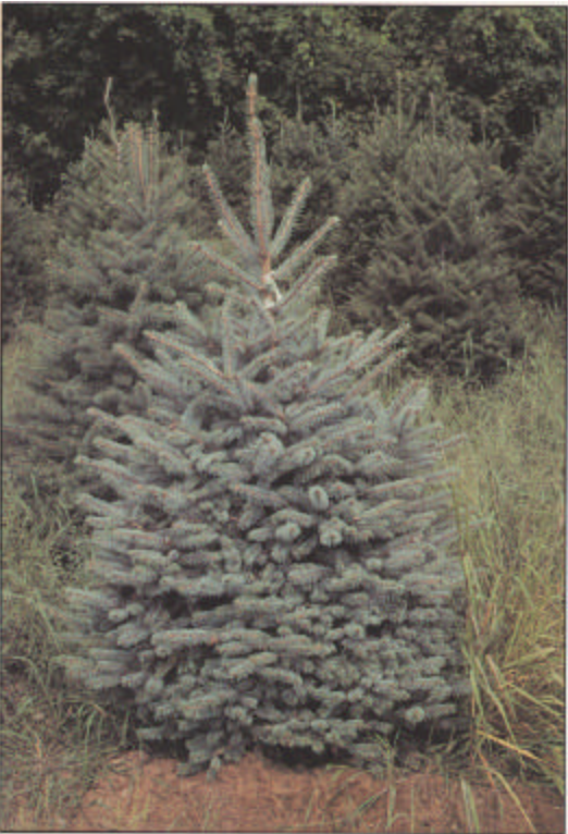
Figure 5. Colorado blue spruce is widely planted throughout the region. Its attractive foliage and pleasing natural symmetry contribute to its increasing popularity as a Christmas tree.