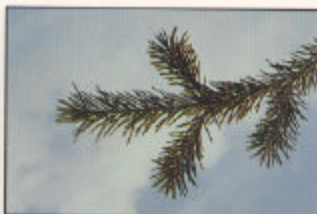
Characteristic Douglas fir needle/twig pattern.