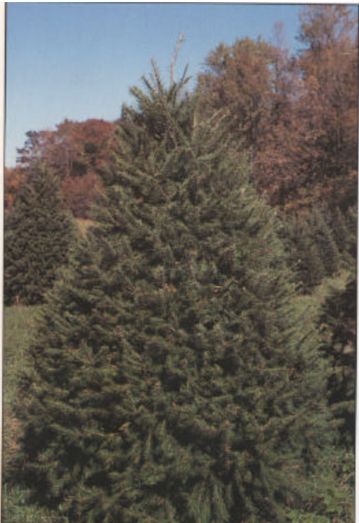
Figure 13. Douglas fir of Rocky Mountain seed origins will grow satisfactorily in many areas of the North Central states. It is characterized as a symmetrically shaped tree which has soft, fragrant foliage.