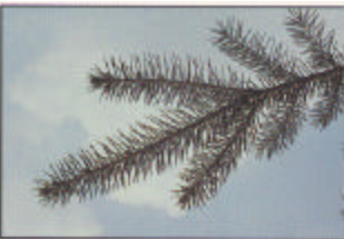
Characteristic Colorado blue spruce needle/twig pattern