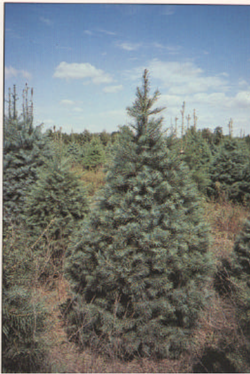
Figure 12. Concolor or white fir grows well in plantations if effective weed control is present. Its long, silvery-blue needles, combined with excellent fragrance, contribute to its increasing popularity.