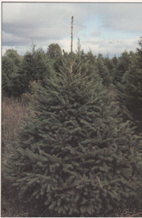
Figure 8. Spartan spruce is new in the Christmas tree industry. This hybrid between Colorado blue spruce and white spruce is characterized by the bluish color of blue spruce and the soft foliage and faster growth rate of white spruce.