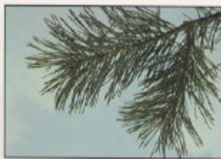
Characteristic Scotch pine needle/twig pattern.