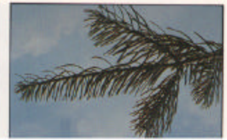
Characteristic Concolor fir needle/twig pattern