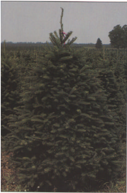
Figure 11 Canaan fir has been successfully established in plantations in portions of the North Central region. It is well adapted to somewhat poorly drained soils and to areas where late spring frosts occur.