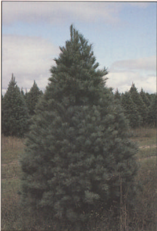
Figure 3. Southwestern white pine is characterized by attractive blue-green foliage. It is not widely planted because of difficulty in developing trees with full, uniform foliage.