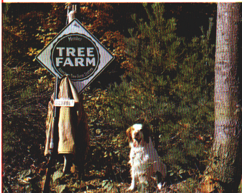
Fig. 2. (left) Woodlots can be managed for many uses including timber, wildlife, aesthetics and recreation.

A timber stand improvement cut is the most immediate need in most hardwood forest stands. Deformed, diseased, damaged or otherwise defective trees will not produce high-value timber products. In addition, such trees compete with more desirable trees for available moisture, nutrients