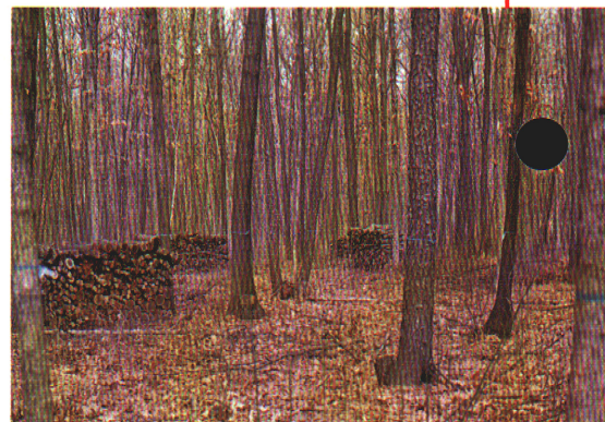
Fig. 3. In a TSI operation, undesirable trees are removed to provide adequate growing and reproduction space for remaining trees.

Information on how to complete a timber stand improvement operation is contained in MSU Extension Bulletin E-1578 "Improving Hardwood Timber Stands." Included are suggestions for selecting the best trees of desirable species and maintaining proper spacing. On-the-ground management assistance can be obtained from your local Michigan Department of Natural Resources field office and county Soil Conservation District office. Assistance is also available from consulting foresters and from some of the larger forest industries in the state. Additional information on woodlot management and related subjects is also available from your local Cooperative Extension office.