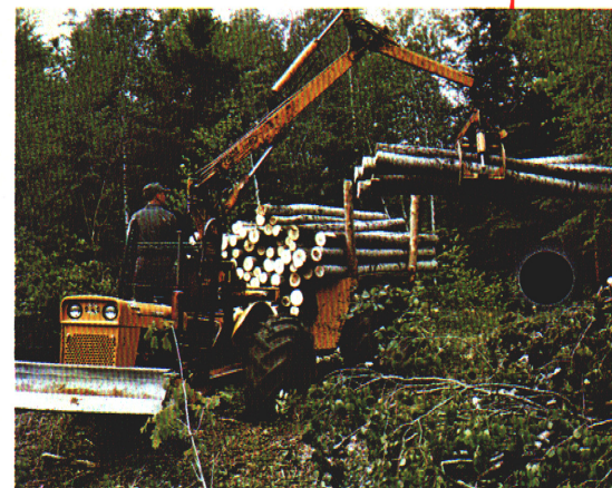
Fig. 4. Most woodlots can be managed to produce forest crops on a continuing basis by applying periodic thinning and harvesting operations.