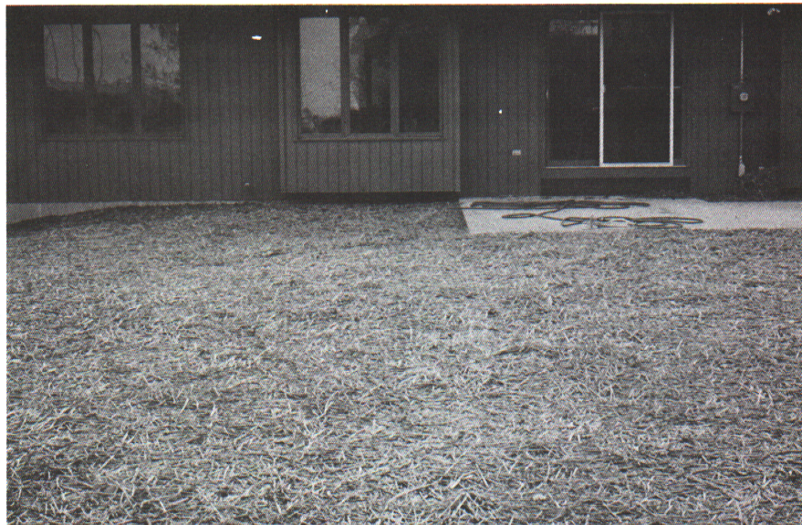
A straw mulch stabilizes the seed and soil and conserves moisture, improving germination.

Proper site preparation is important in the establishment of a lawn.