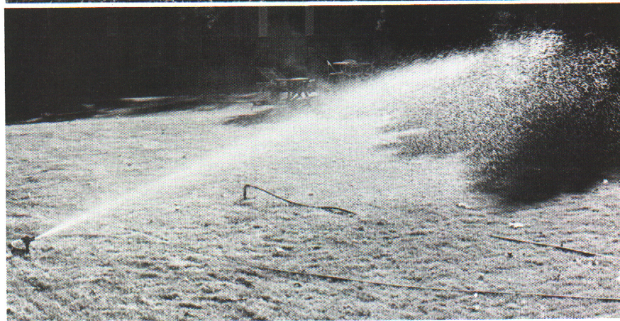
Two types of sprinklers that can be attached to a hose are the oscillator type (top) and the rotary impact (bot.).

water and equipment must be considered. The following guidelines will help to maintain a desirable lawn quality, and avoid wasting water.