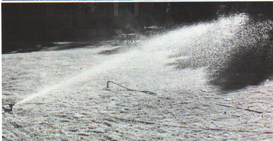
Two types of sprinklers that can be attached to a hose are the oscillator type (top) and the rotary impact (bot.).

water and equipment must be considered. The following guidelines will help to maintain a desirable lawn quality, and avoid wasting water.