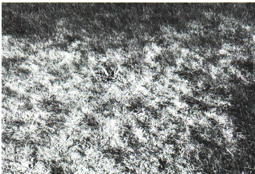
Figure 3. Chinch bug damage.

2) A small area of lawn can be flooded to the puddling point to