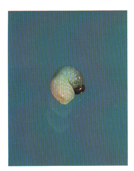
Figure 3. Billbug larva.