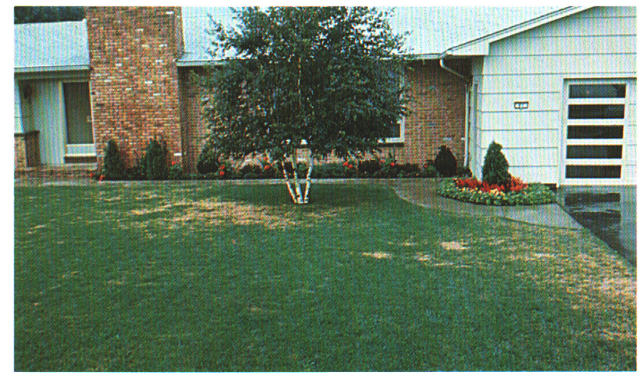
Figure 2. Billbug damage (From Insects Of Turfgrass In The Northeast by H. Tashiro and G. Catlin, Cornell University, N.Y.S. Agric. Exp. Station, Geneva, N.Y.).

Damage from fusarium blight is also similar to early billbug injury, but the diseased areas are larger and usually have live patches of