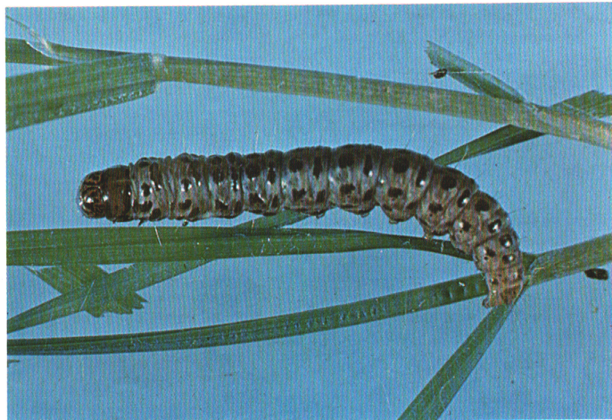
Fig. 2. Sod webworm larva.