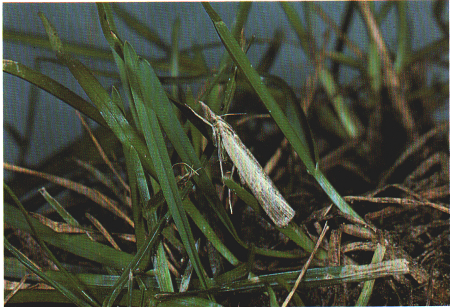
Fig. 1. Sod webworm adult.

Generally, if no feeding injury or larvae are found, the problem is likely due to some other agent, and insecticide applications will be useless.