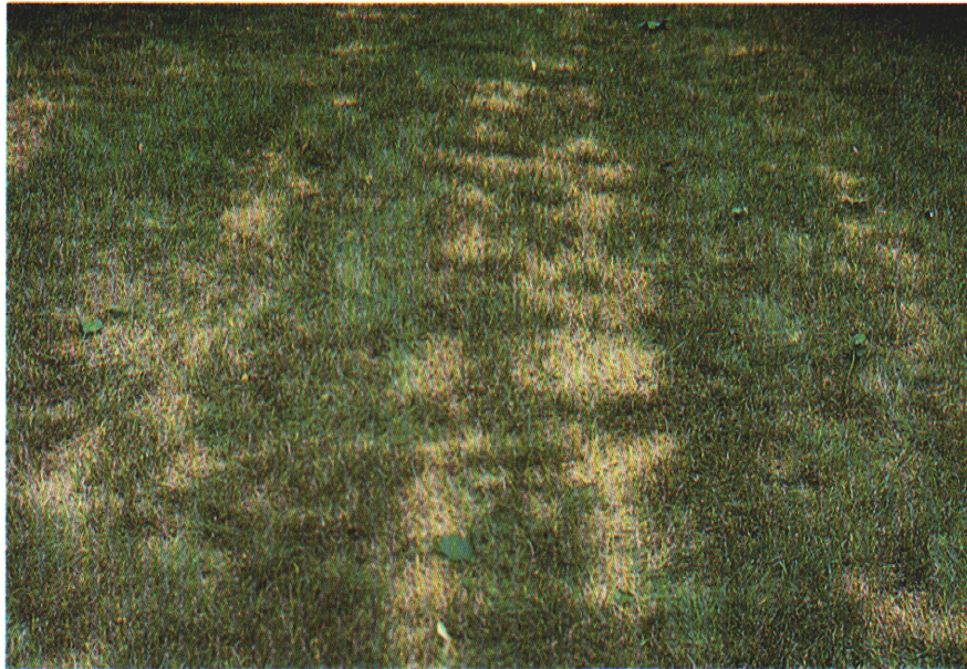
Fig. 3. Damage to lawn from sod webworms.