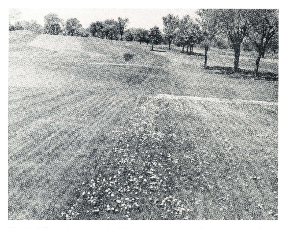
Fig. 4. Effects of 2,4-D on dandelions in turf. Lower right, unsprayed.

When weeds are killed in infested lawns and turfs, bare spots will appear. Unless reseeding with grass is accomplished, other weeds