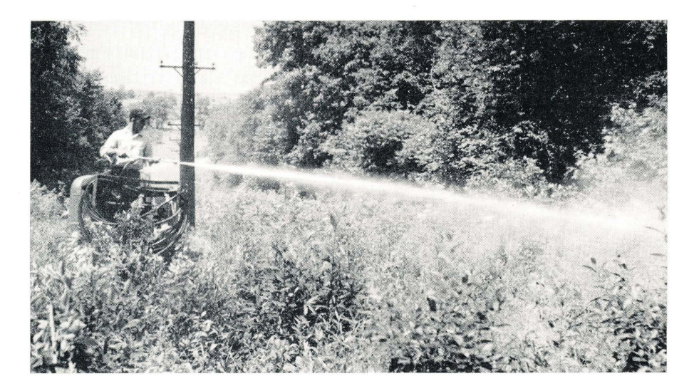
Fig. 3. Power sprayer and spray gun for use in brush control. High pressure aids in getting spray to penetrate mass of foliage.