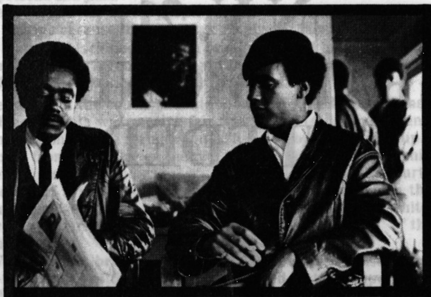
July 1967--Minister of Defense, Huey P. Newton (right) and Chairman, Bobby Seale (left), reading an early edition of B.P.P. Newspaper at the home of Eldridge Cleaver, Minister of Information B.P.P.

Huey would say, "a newspaper is the voice of a party, the voice of the Panther must be heard throughout the land."