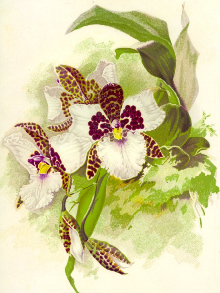
ODONTOGLOSSUM, ROSSII-MAJUS WOODLANDS VARIETY.