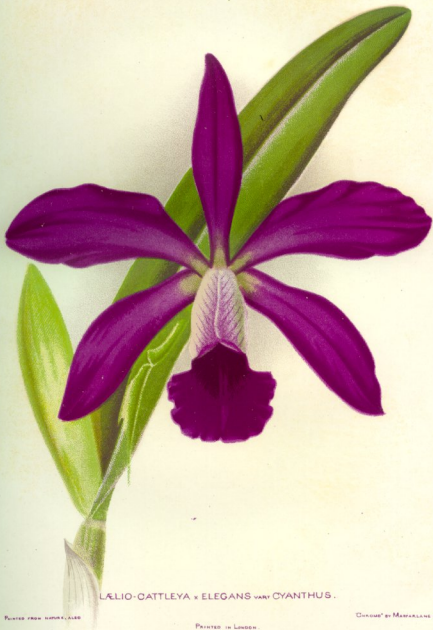
LÆLIO-CATTELEYA x ELEGANS VARI CYANTHUS.