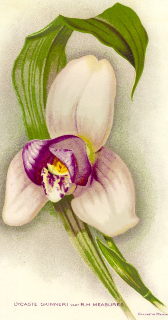
LYCASTE SKINNERI VAR. R.H. MEASURES