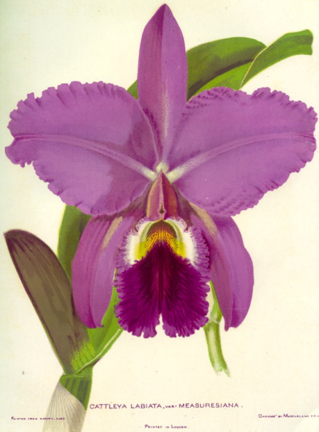
CATTLEYA LABIATA, VAR. MEASURESIANA.