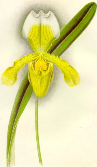
CYPRIPEDIUM INSIGNE, VAR. SANDERÆ.