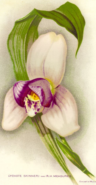
LYCASTE SKINNERI VAR. R.H. MEASURES