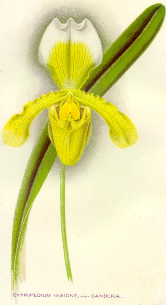
CYPRIPEDIUM INSIGNE, VAR. SANDERÆ.