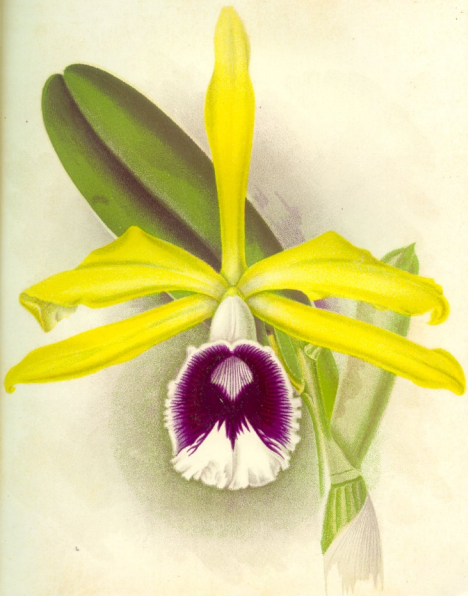
LALIA, GRANDIS, TENEBROSA. WALTON GRANDE VARIETY.