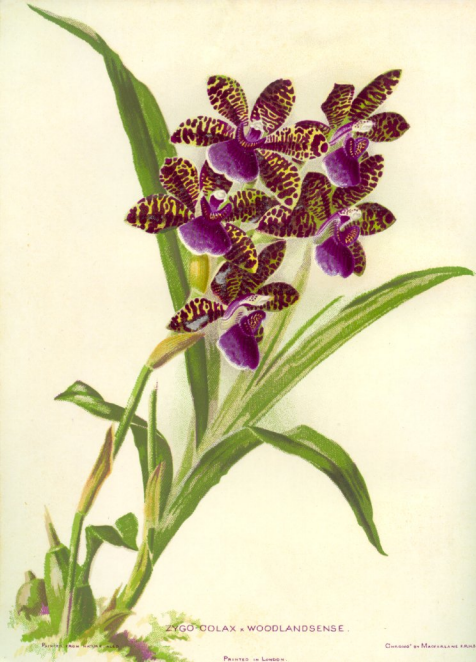
ZYGO COLAX x WOODLANDSENSE.