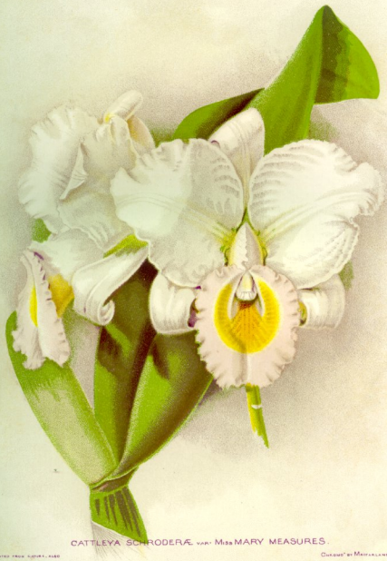
CATTELYA SCHRODERÆ var. MISS MARY MEASURES.