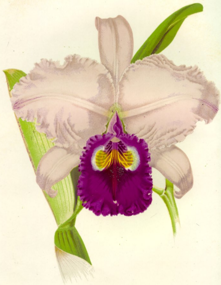
CATLEYA TRIANAË, VAR. MEASURESIÆ.