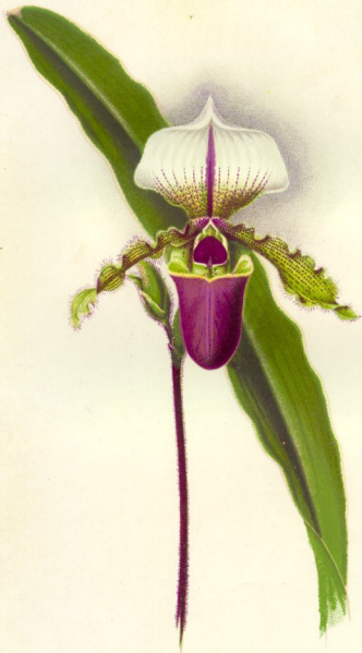
CYPRIPEDIUM x D o RYAN .