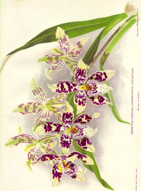
ODONTOGLOSSUM, x HARRYANO-CRISPUM.