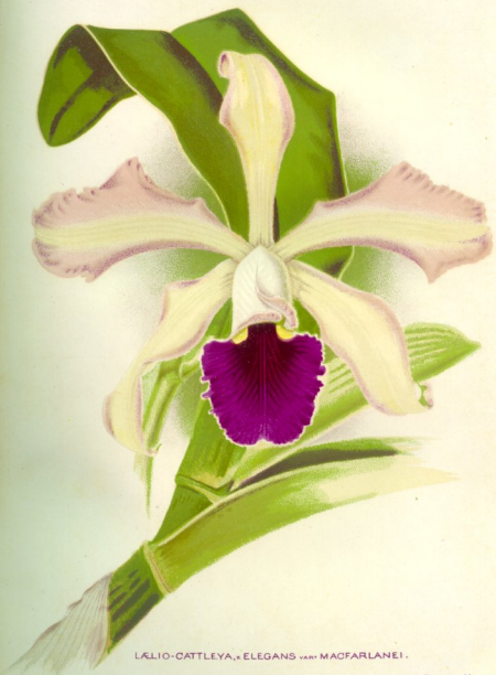
LALIO-CATTELEYA, x ELEGANS VARI MACFARLANEI.