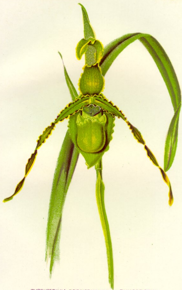
CYPRIPEDIUM BOISSIERIANUM VAR. BUNGEROTHI.