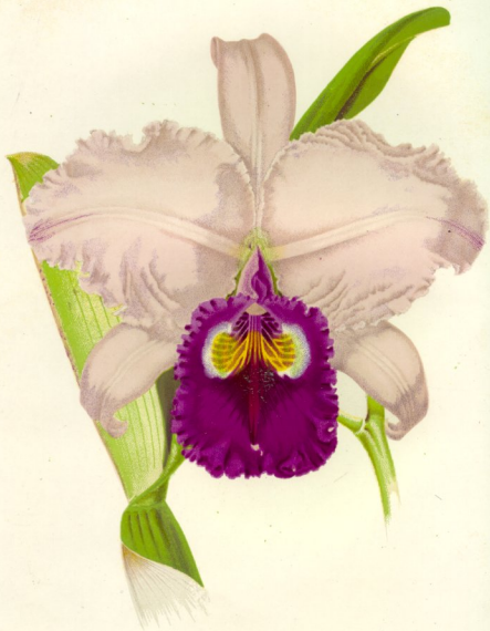
CATLEYA TRIANAЕ, VAR. MEASURESAE.