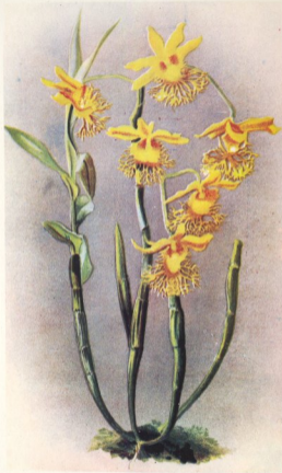
DENDROBIUM BRYMERIANUM. Reduced to One Fourth