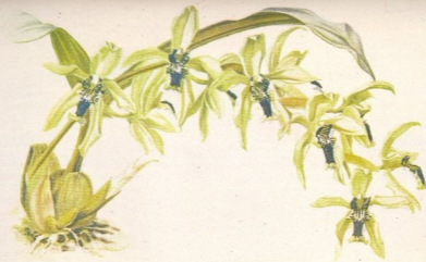
COELOGENE PANDURATA. Reduced to One Sixth