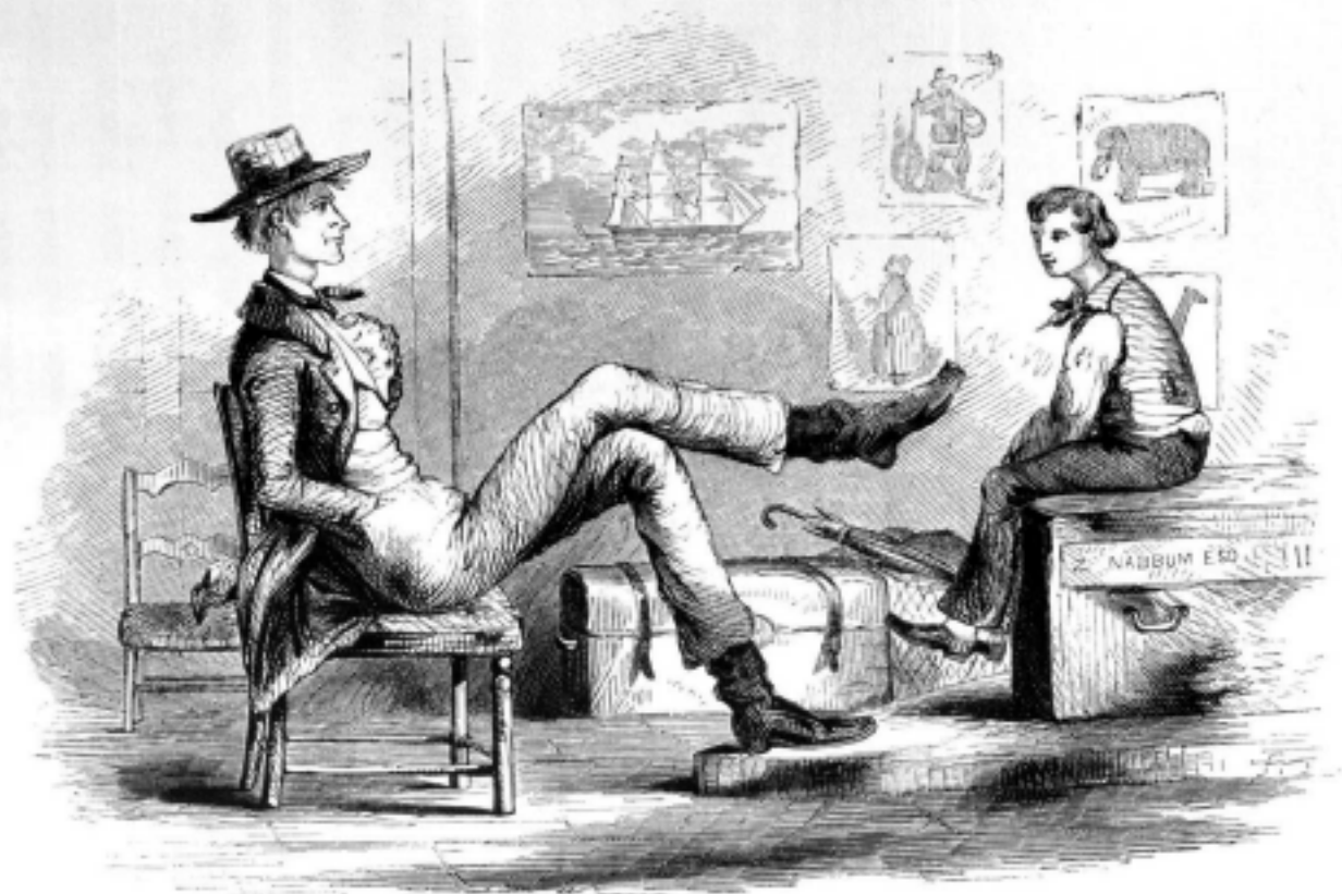
MR. NABBUM HEARS LITTLE JACKET'S STORY.