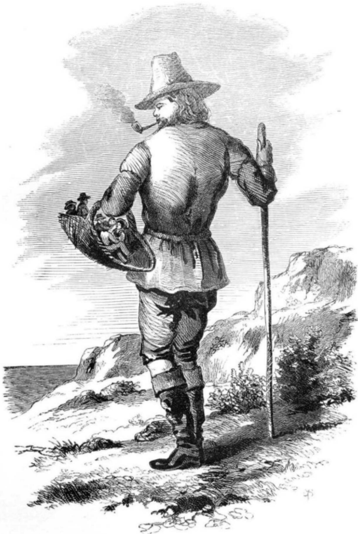
A NEW MODE OF CONVEYANCE.