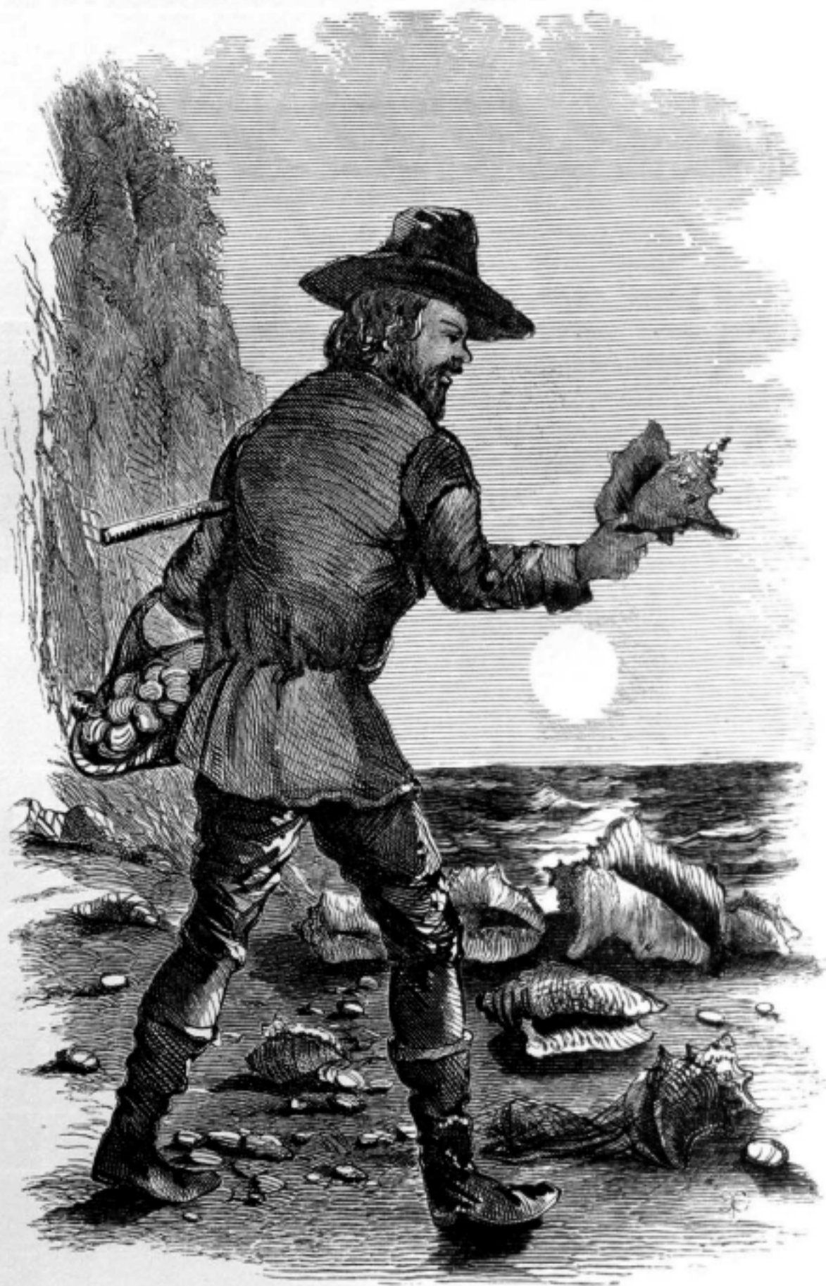
THE GIANT PICKS UP LITTLE JACKET'S BEDROOM.