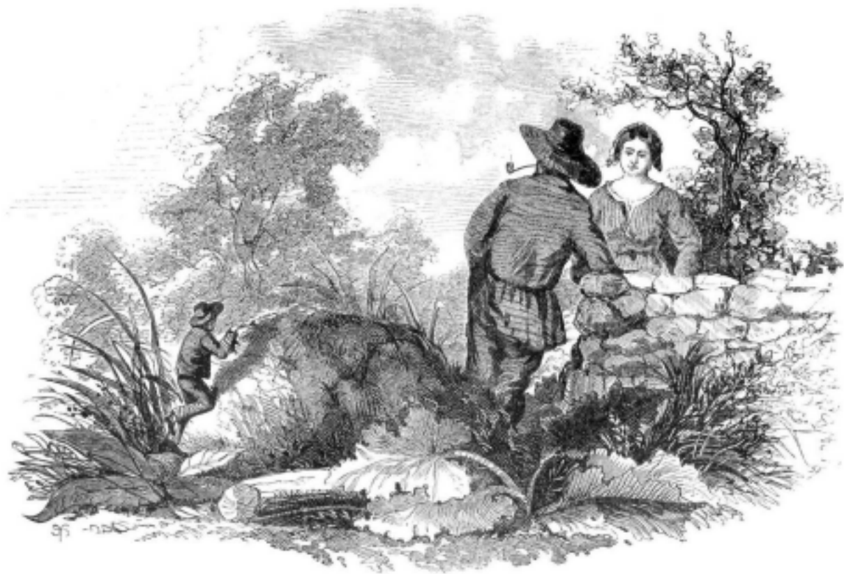
A PEEP AT THE HUGGERMUGGERS.