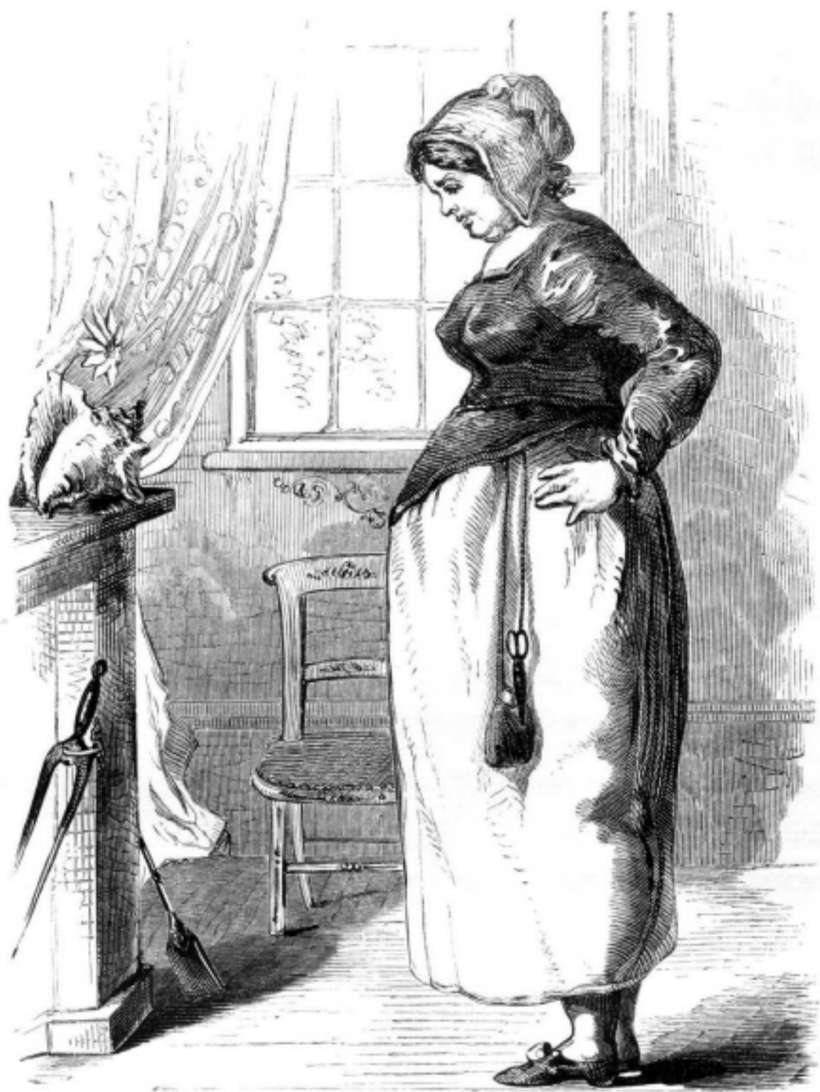
MRS HUGGERMUGGER ADMIRES THE SHELL AND SUNFLOWER.