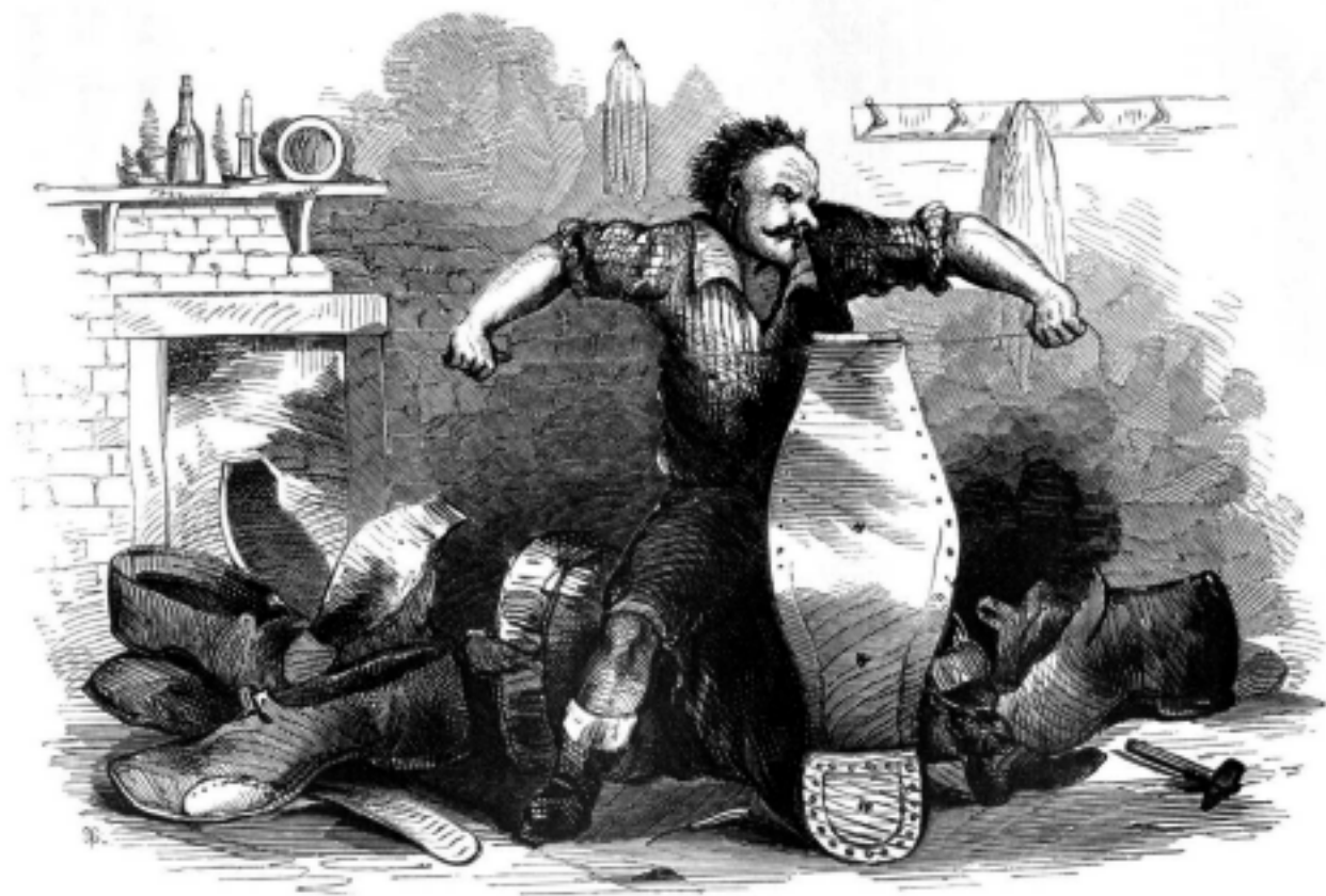
THE SHOEMAKER AT WORK.