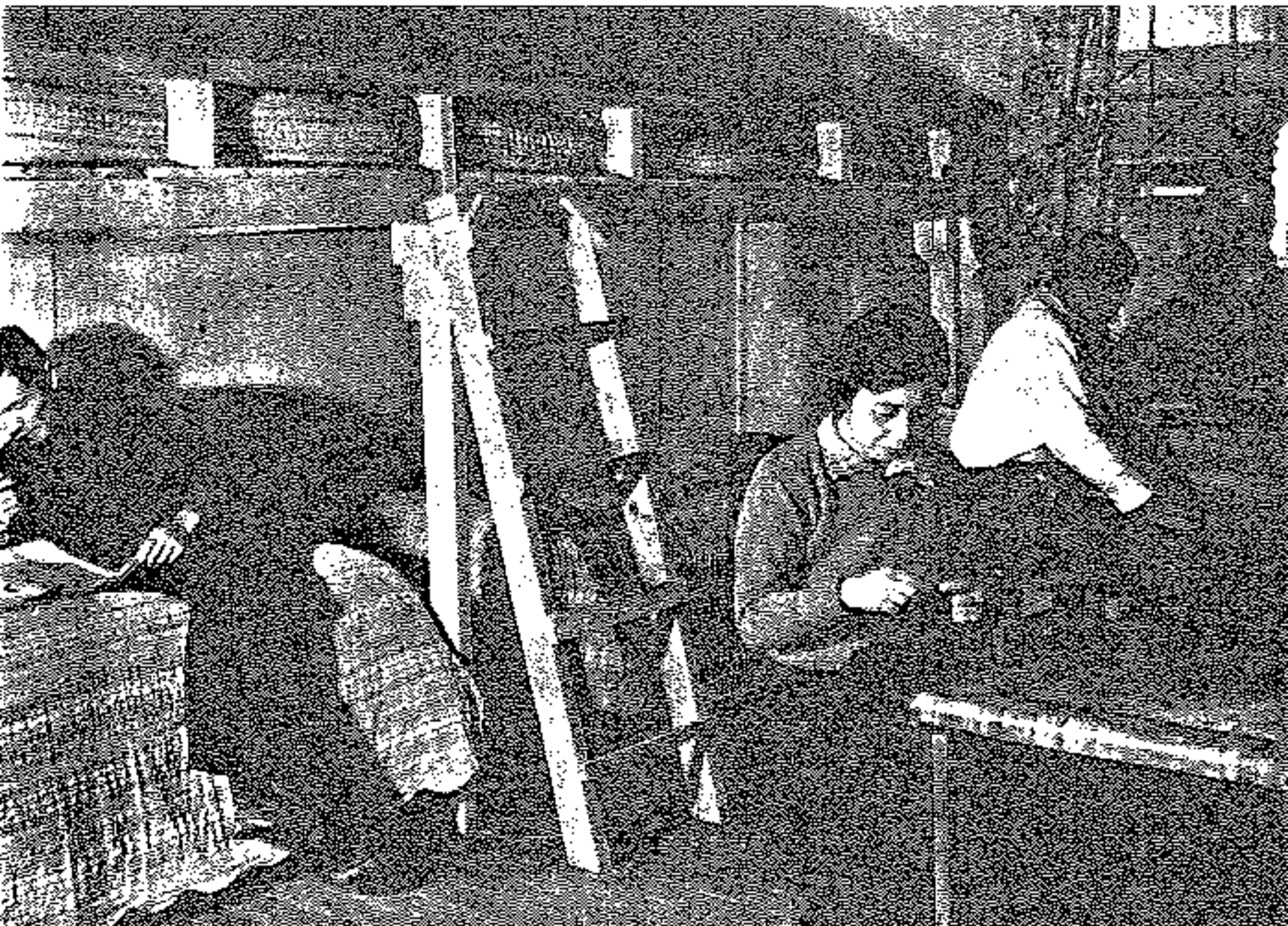
Improvements in family living quarters are made by the evacuees themselves from scrap materials.

The specific procedures being followed have been approved by the Department of Justice as sound from the standpoint of national security and have been endorsed by the War Manpower Commission as a contribution to national manpower needs. As the program moves forward, the costs for maintenance of the relocation centers will be steadily reduced.