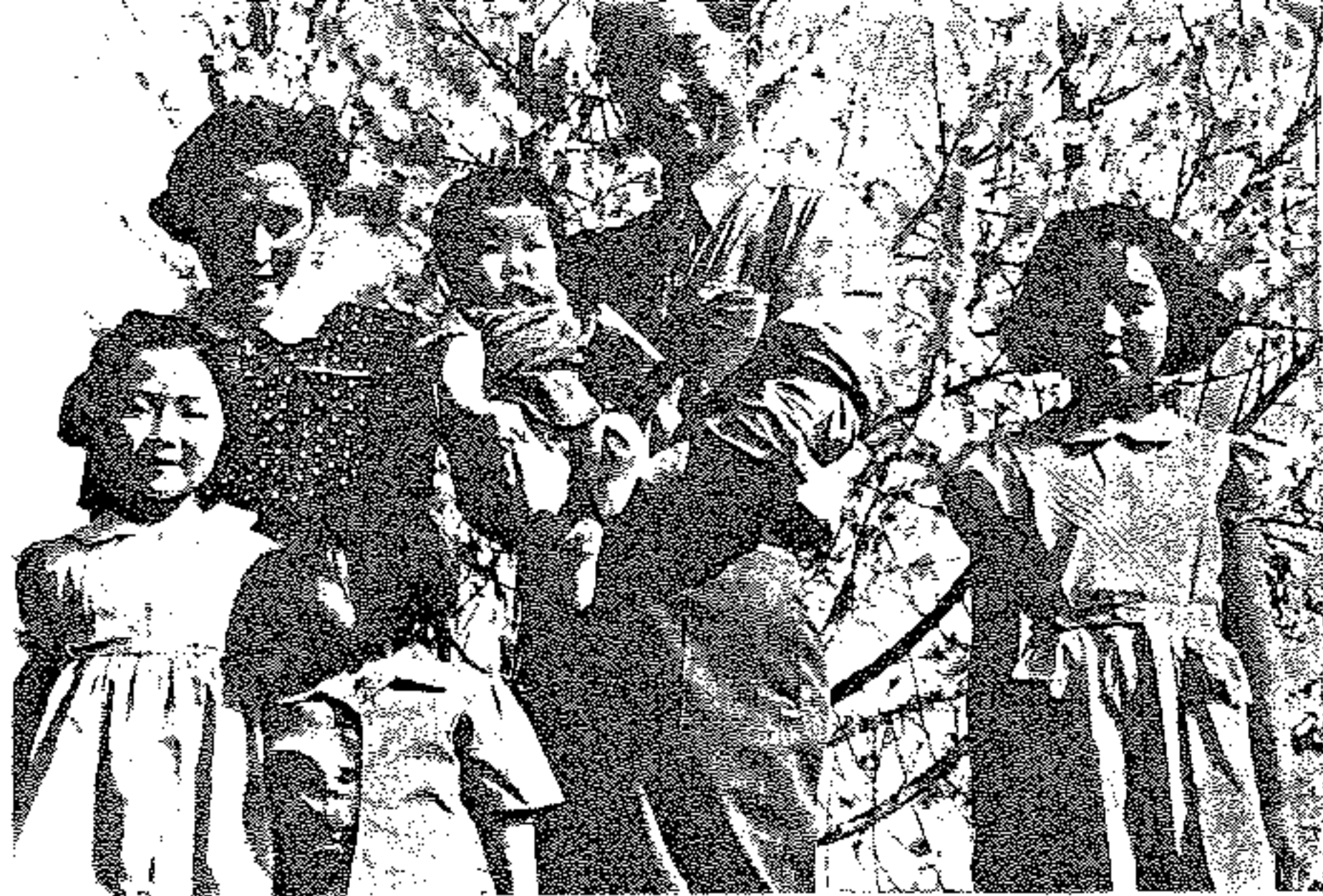
An American family of Japanese descent.

the latter part of March, it had become apparent that such a large-scale exodus could be handled effectively only on a planned and systematic basis. Accordingly, all further voluntary evacuation was halted by the Western Defense Command on March 29 and plans were initiated by WRA for establishing relocation centers with sufficient capacity and facilities to handle the entire evacuated population for as long as might be necessary.