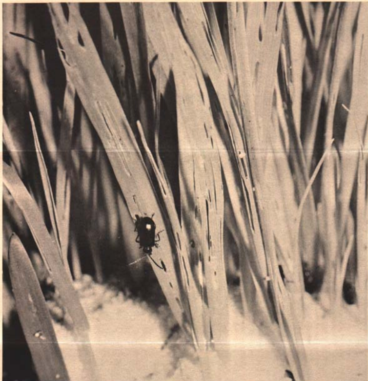
The adult is \frac{3}{16} inch long. The head and hard wing covers are metallic-blue-black. The legs and front part of the thorax just behind the head are orange-red. Adult feeding damage consists of long strips of leaf tissue completely removed from between the veins.