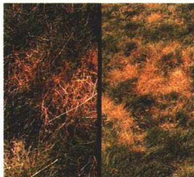
12. Red thread and pink patch