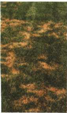
6. Fusarium blight