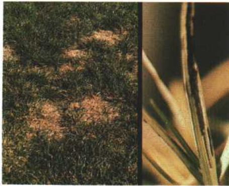
2. Stripe Smut