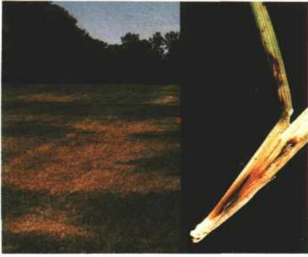
1. Helminthosporium melting-out and leaf spot