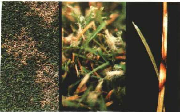
4. Sclerotinia dollar spot