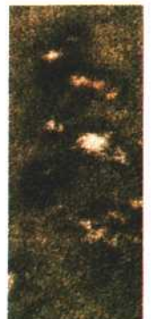
14. Dog injury