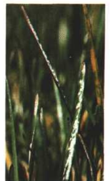
10. Powdery mildew