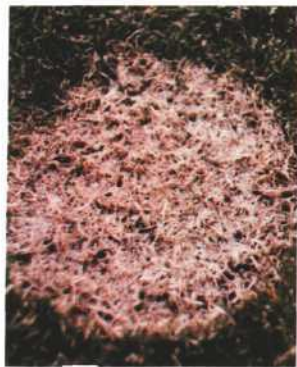
7. Fusarium patch