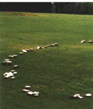
11. Fairy rings