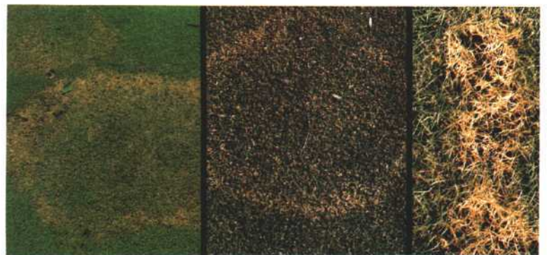
5. Rhizoctonia brown patch, yellow patch, and seedling blight