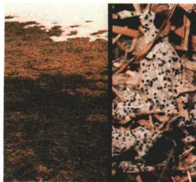
8. Typhula blight