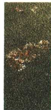
9. Pythium blight