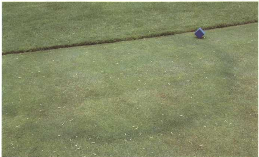
Figure 2: Fairy ring may not kill turf, but can cause yellowing and stunting to occur.