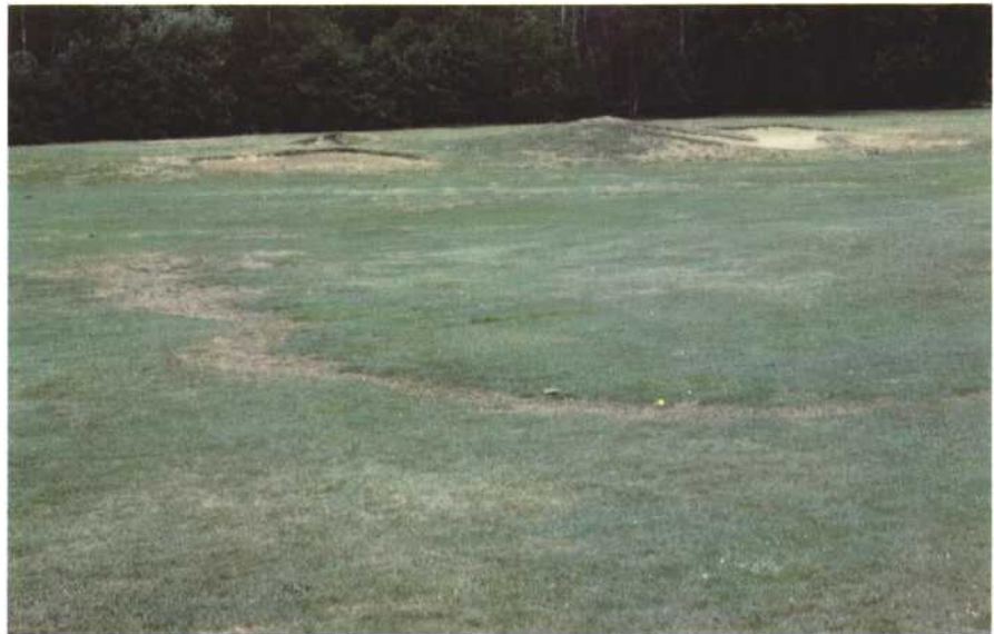
Figure 1: A characteristic fairy ring showing the stimulated growth area and deadened region at the outer edge.

A circular fairy ring develops because the fungi starts out from a central point and grows equally in all directions. The fungi break down the organic matter as they grow, releasing nitrogen (ammonia) that eventually is changed by other microorganisms to nitrate nitrogen. The nitrate nitrogen stimulates turfgrass growth within the ring (known as the zone of stimulation or activity zone). Turf may first appear dark green, but will eventually die if stressed by heat or drought (Fig. 1). Sometimes the turf may simply turn yellow or be stunted (Fig. 2). If the turf is adequately watered it usually will recover from the yellowing, but the stunting may remain. The yellowing, stunting and turf death within the ring has been attributed to a number of causes. Mushrooms are often found in the