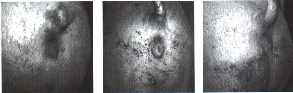
Figure 2. Select gilts with normally developed external genitalia (left). Gilts with small infantile (center) or abnormal (right) vulvas should not be kept.

Isolation and acclimation. Isolation of incoming breeding animals may be the most important part of a herd health program. The isolation program should be developed with your herd veterinarian to minimize the risk of introducing new disease organisms.