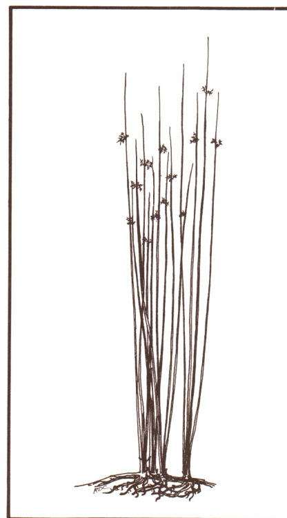
Rush ( Juncus effusus ) —Clumps of stems rise from stout horizontal rootstocks, grow 3 to 4 feet tall resembling grasses and sedges. Greenish-brown flowers near tip of stem.