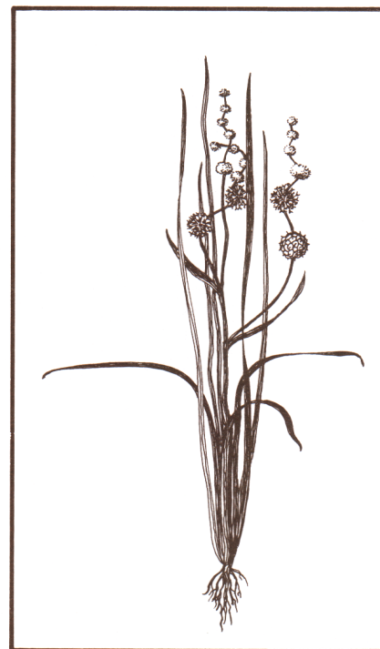
Burreed ( Sparganium eurycarpum ) —Leaves long, erect, ribbon-like, usually 1 to 3 feet high. Stems bear male flowers at tip, female flowers below. Fruiting heads are one-inch round balls containing many seeds.