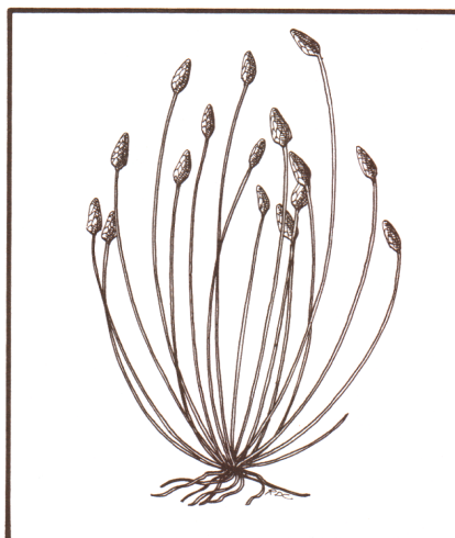
Spikerush ( Eleocharis species) —Clumps of stems rise from shallow roots, remain much shorter than rushes. Oval fruiting spike at end of stem.