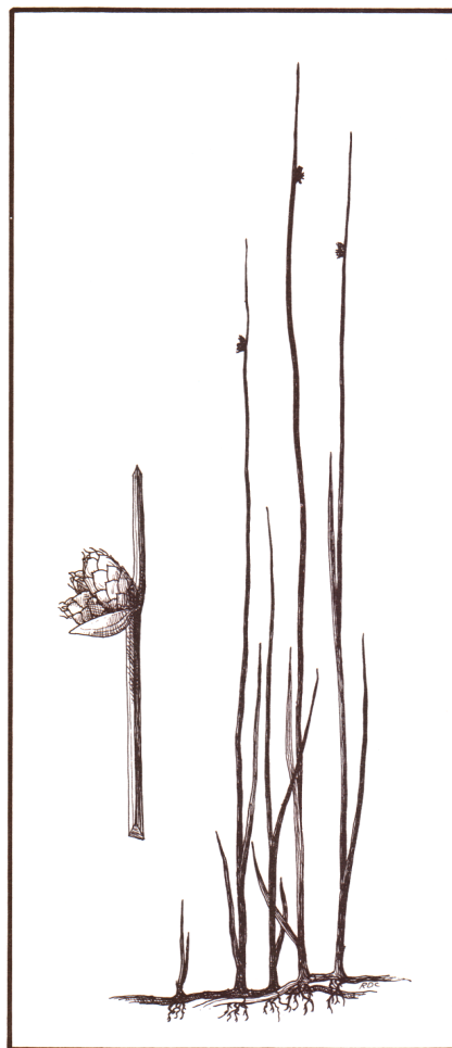
Bulrush ( Scirpus americanus ) —Horizontal rootstocks give rise to stems with triangular cross section (but round in some bulrushes). Height usually 2 to 3 feet. Flowers and seeds on spikes along stem near tip. The plants may form dense stands after several years.