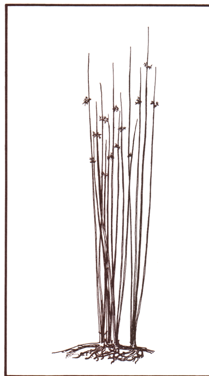
Rush ( Juncus effusus ) —Clumps of stems rise from stout horizontal rootstocks, grow 3 to 4 feet tall resembling grasses and sedges. Greenish-brown flowers near tip of stem.