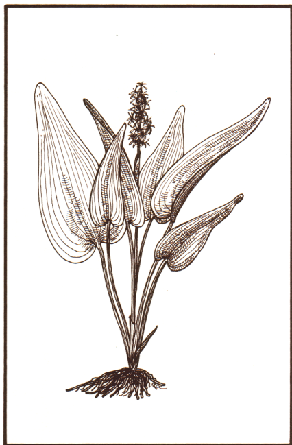
Pickerelweed ( Pontederia cordata ) —Leaves heart-shaped, similar to those of arrowhead but rounded at tip and corners. Curving veins follow leaf margin. Flowers blue and grow in a spike.