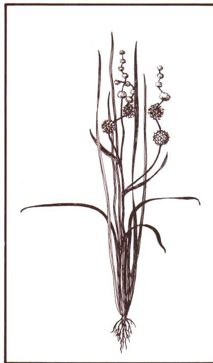
Burreed ( Sparganium eurycarpum ) —Leaves long, erect, ribbon-like, usually 1 to 3 feet high. Stems bear male flowers at tip, female flowers below. Fruiting heads are one-inch round balls containing many seeds.