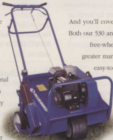
742 covers a 25 1/2" wide swath