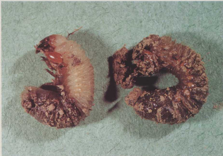
Most of the newer insecticides are target-selective, providing reduced hazards and low environmental risk. Here, grubs were induced to undergo an abnormal, lethal molt following ingestion of MACH2, a molt-accelerating compound.

Preventive grub insecticides do have limitations. Neither Merit nor MACH2 works well against large grubs. MACH2 will control small- to mid-sized grubs (up to the second instar) for several weeks after egg hatch, but as a "rescue" treatment it works too slowly to discourage skunks and other predators from digging. Both insecticides work well against masked chafers, Japanese beetles and black turf atenius grubs. MACH2 is less effective than Merit against European chafers and Asiatic garden beetles, but it's