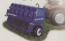
TA10 Towable w/modular weight system