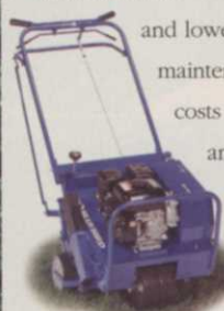
The new 530 features free-wheeling outer tines for greater maneuverability.

And you'll cover more ground too. Both our 530 and 742 Aerators have free-wheeling outer tines for greater maneuverability, they're easy-to-use, and two of the most productive walk-behind aerators, covering up to 37,100 sq. ft./hour. For more about BlueBird Aerators and for the distributor or dealer nearest you, call 1-800-808-BIRD.