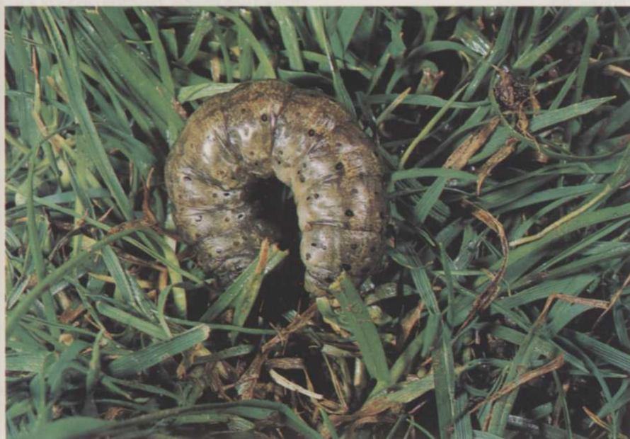
Several newer classes of insecticides effectively control cutworms and other surface-feeders.