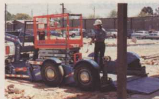
Elevating platform trailer

The elevating platform trailer from Lift-A-Load, Kewanee, IL raises from the ground to 52 in. high