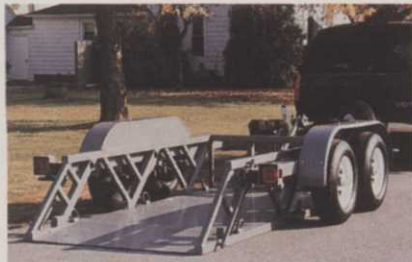
Workforce Escalate equipment trailer