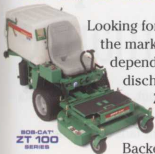
BOB-CAT® ZT 100 SERIES

Backed by a 3-year, no-crack deck warranty and a 2-year, no-fail spindle warranty*, the ZT Series delivers a professional cut for years to come. Turn to Bob-Cat for zero-turn performance and zero compromise. Call 1-888-922-TURF .