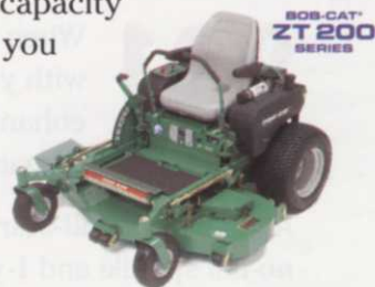
BOB-CAT® ZT 200 SERIES