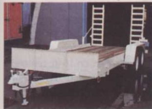
The 3500-L from Deande

The 3500-L from Deande, Trenton, NJ comes in two models with a 12-ft. or 14-ft. bed. Unit is equipped with pressure-treated floor, tie off loops and rides on a Dexter 3500-lb., 4-in. drop axle. Also available is the SS7500, a 4-