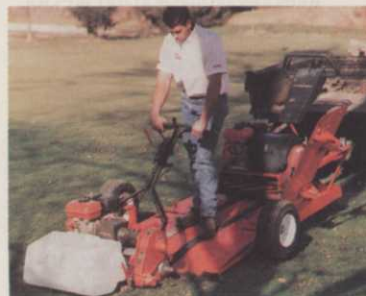
Smithco's customized trailer

The new Double Mow-n-Go PGM Trailer from Smithco, Wayne, PA carries two mowers loaded front-