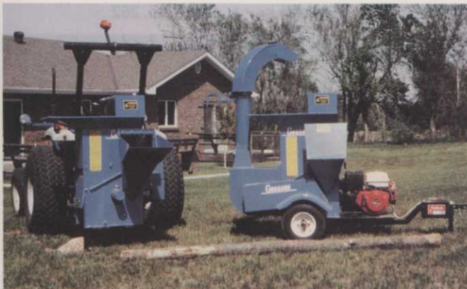
Goossen makes three models of chipper/shredders.

Chew up limbs up to 5-in. diameter and shred leaves or brush into a decorative mulch with Goossen Chipper/Shredders, made in Beatrice, NE. Three models are available: CS1000, a 540-pto unit; CS5100, with a 13-hp Honda gas engine; and the CS6000, with an 18-hp Honda gas engine. Blower and vacuum attachments are available. All have hinged housing for easy access to the cutting