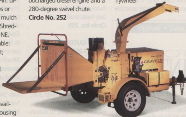
Gravelly Pro Chip 12108