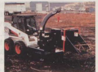
Bobcat chipper attachment