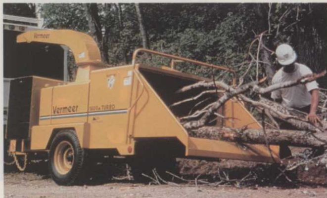
Vermeer's 1800A chipper

ADVANSTAR MARKETING SERVICES 1-800-736-3665 216-891-2744 FAX: 216-891-2740