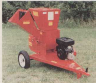
Mackissic self-feeding tube

The SC260 chipper/shredder from MacKissic, Parker Ford, PA, chips logs up to 4 in. in diameter through the self-feeding infeed chute. It will shred debris and branches up to one inch in