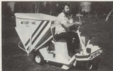
Riding Model 80

Only sweeper for both turf and pavement. Grass, glass and trash... wet or dry. Sweeping widths from 4 to 10 ft. Self-propelled and tow-type, both with ground dump and power lift dump.