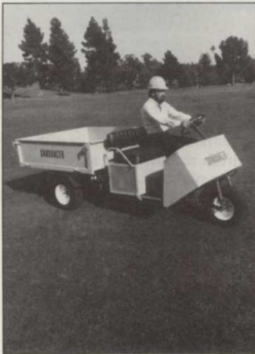
3 or 4 wheel models

Versatile multi-purpose work vehicle. Hill-climbing 18 h.p. gas engine with a unique power train that eliminates stripped gears and burned-out clutches. Three models and a wide selection of options allow you to build a SANDANCER to match your work needs.