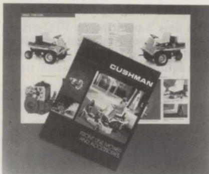
Circle No. 192 on Reader Inquiry Card

Accessories available for the 1985 Front Line tractor include a new cab with larger side windows, snow thrower, rotary brush attachment, and the Cushman Grass Caddy with 16-bushel hopper with hydraulic dump controls.