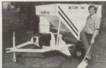
Model FM-5 with hand intake hose