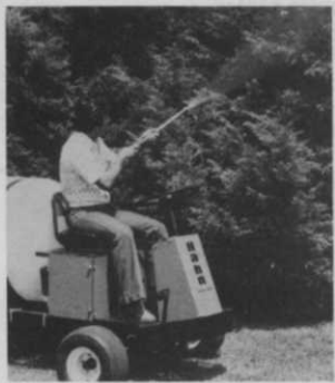
HAND GUN and 25 ft. hose permits spraying trees and shrubs on the move. Optional.

16 h.p. Kohler cast iron engine. Three-speed transmission. Hydraulic brakes. Automotive type steering.