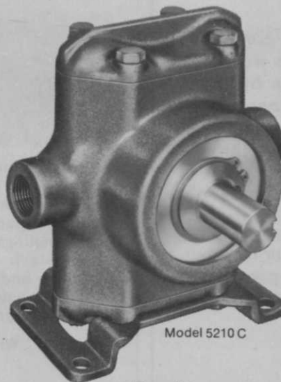
Model 5210 C