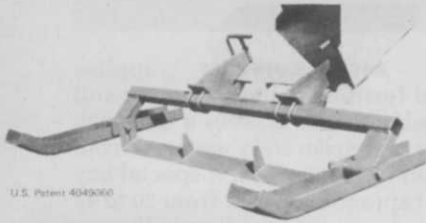
U.S. Patent 4049060

Sod cutters , which manually clamp onto either backhoe or loader buckets, quickly cut sod to a uniform thickness and slice it into easily handled strips. Two models, 27 and 40,