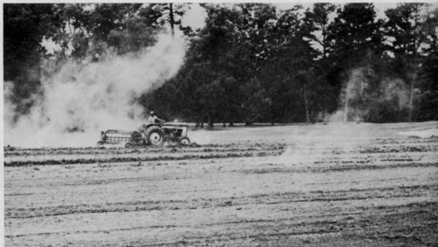
Raking up old turf on fairway, Southern Turf crewman readies soil for replanting new grass.