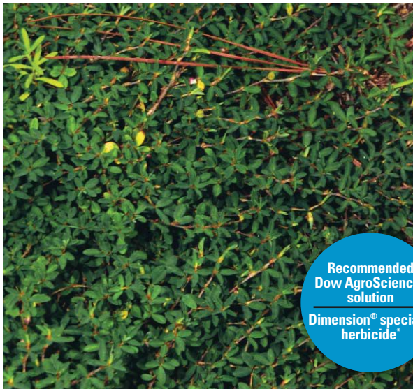
Recommended Dow AgroSciences solution Dimension® specialty herbicide*

STANDING SENTINEL TO PROTECT PLANT HEALTH