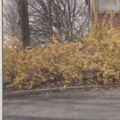
FIGURE 2. In the northern United States, the best time to apply a pre-emergence herbicide for the control of crabgrass is when Forsythia x intermedia is in bloom (shown). The blooming of either dogwoods or azaleas is often used to indicate proper timing in the South.

There tends to not be a significant difference in crabgrass control whether the same active ingredient is applied as a liquid or as a granular formulation. Both require light irrigation for activation. One note of caution, however — pre-