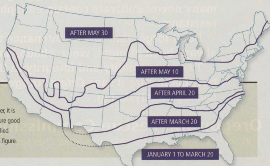
FIGURE 1. Expected dates of crabgrass germination. While crabgrass can germinate earlier, it is often killed by late spring frosts. However, to ensure good control, preemergence herbicides are usually applied about three weeks prior to the dates listed in this figure.