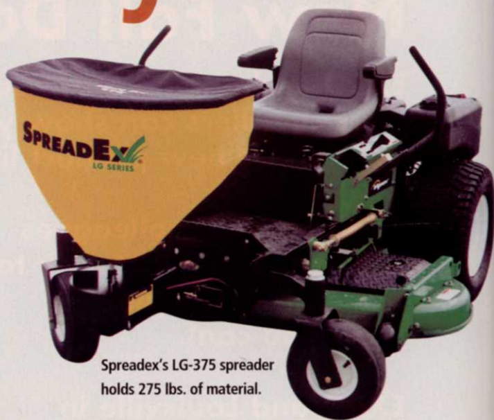
Spreadex’s LG-375 spreader holds 275 lbs. of material.

One way to do the job more effectively, Kinkead says, is to buy a spreader that will do an even number of passes up and down a field. If a machine will hold enough fertilizer to do four passes (up, down, up,