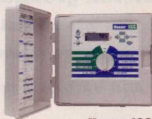
Hunter ICC Ideal for parks, sports fields; handles 8 to 48 zones

Only Hunter has it – the industry's most complete line of modular controllers for all residential and commercial applications. Now you can customize the irrigation at any site with expandable zone modules, independent scheduling and easy dial programming.