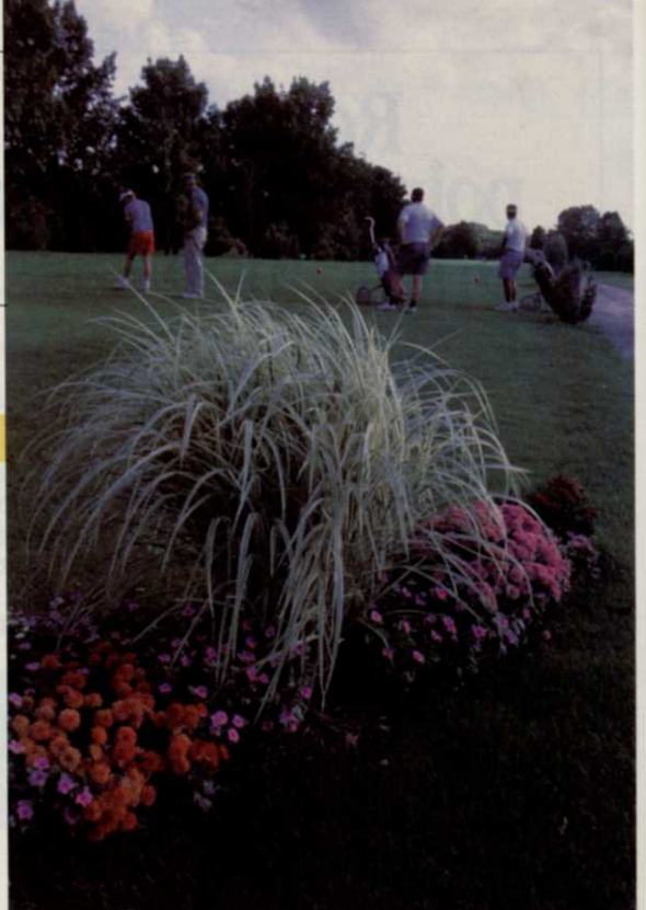
• The strongest focal points Combine annuals and ornamental grasses for an are around the tee box, about exotic and colorful impression.

will pay off if players spend an hour in that area as they wait for play to begin.