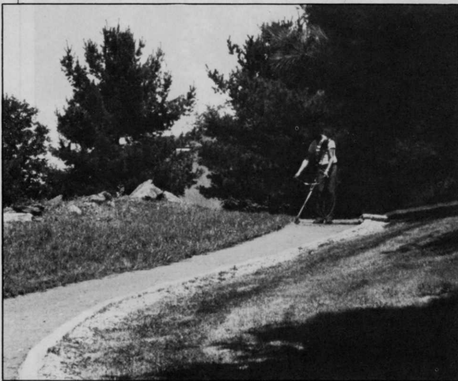
Trimming and all other landscape tasks are performed by Labriola's crew.

The landscape maintenance contract is very inclusive of the many areas that make up a corporate headquarters. One of the few duties that is not in the contract is the replacement of trees. Toth forecasts future budgets as much as five years ahead and tree replacement is one of the areas that he leaves out. By forecasting so far ahead Toth is able to secure funds for projects ahead of time and also be cost effective in his maintenance. While his forecast for 1983 is detailed, his forecast for 1987 is much more vague. He adds more detail to each upcoming year and always stays five years ahead. He told Weeds Trees and Turf that this was difficult for the first five years of the contract period but now it is mostly fine-tuning. The contract is budgeted at approximately $200,000 for 1982 and that includes funds for emergency projects that are necessary but don't appear in the specs. The contract is increased yearly, usually around 10-15% according to the ravages of inflation and the increased scope of the con-