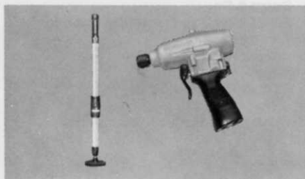
DRILL AND TAMP