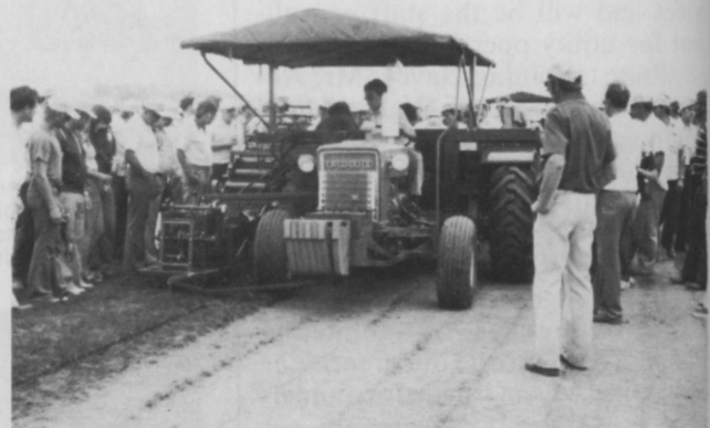
The Brouwer Sod Harvester operates under the critical eyes of some 200 sod producers. Most major sod equipment manufacturers demonstrated at the field days.