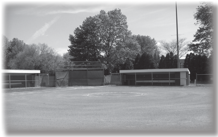
The well-maintained Girls Softball Field at Northern Burlington County Regional High School, site of the 2013 SFMANJ Spring Field Day

The SFMANJ Field of the Year program recognizes the efforts of member sports turf managers throughout New Jersey. Applications for the 2013 Field of the Year are due by the end of October 2013 and are awarded at the NJ Green Expo in Atlantic City, NJ in early December. In addition to a plaque, the winner will receive a complimentary registration to all education sessions, the two day trade show, dinner and one nights lodging at Trump Taj Mahal.