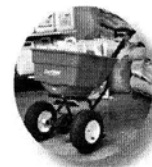
Turf Supplies & Tools

With over 250 branches nationwide, we have a location near you. Stop by and see what we can offer you today!