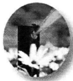
Complete Line of Irrigation Supplies

— Brad Sample, Professional Touch Landscapes, LLC