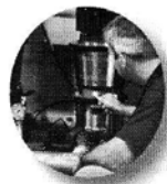
Pumps & Pump Stations