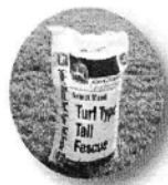
Seed, Sod, Fertilizers & Soil Amendments