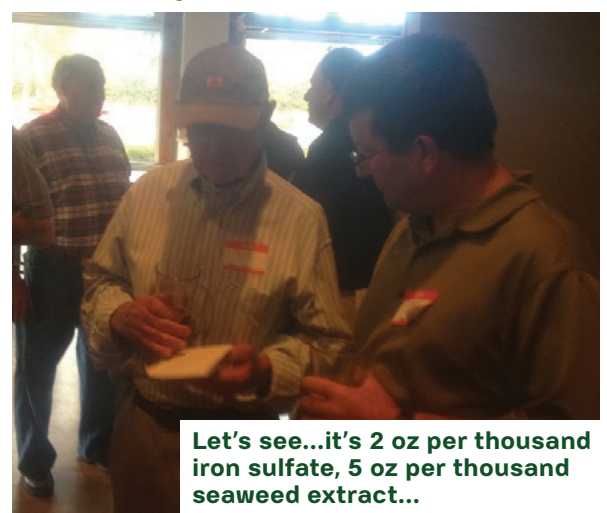
Let's see...it's 2 oz per thousand iron sulfate, 5 oz per thousand seaweed extract...