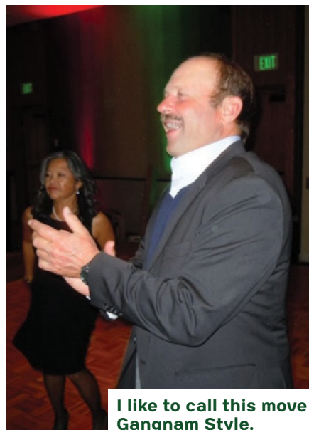
I like to call this move Gangnam Style.