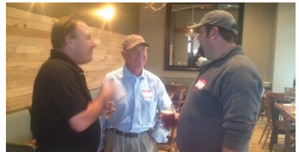
So I yelled, "Baba Booye!" as loud as I could in his backswing and then he turned around and...